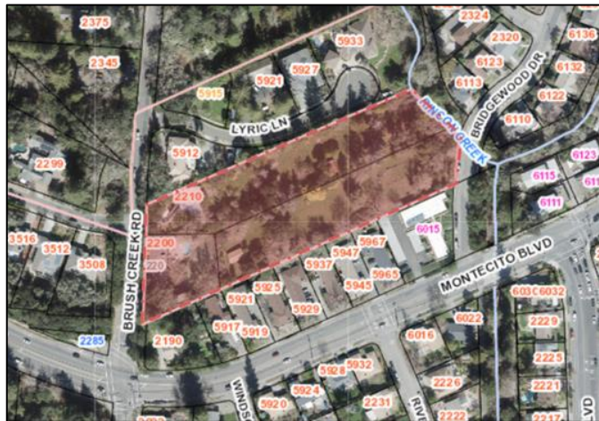
Figure 2: Aerial of surrounding properties.

adjacent to, “Rincon Creek Reach 1: Urban Growth Boundary to Brush Creek,” in the Citywide Creek Master Plan. Rincon Creek Reach 1 is designated as a natural creek consisting of approximately 9,226 linear feet. The property is located west of Rincon Creek, adjacent to the eastern boundary of the parcel. Rincon Creek is a narrow drainage that bisects housing parcels on either side of the banks. The Citywide Creek Master Plan describes this portion of the creek as, “recommended for preservation, due to the habitat value for fish and wildlife. Habitat enhancement is also recommended, including removal of invasive species and replanting with native vegetation.”