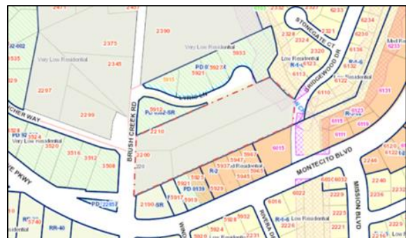
Figure 3: General Plan designations.

The project site is within the City Urban Growth Boundary (UGB) and is directly adjacent to parcels within the City boundary to the north and east. The property to the north is a Planned Development that is developed in a similar configuration with a five-lot subdivision. The properties on the other side of Rincon Creek have a General Plan land use designation of Low Density Residential and are developed per R-1-6 standards. The parcels 115-feet south from the project site front onto Montecito Blvd and have a General Plan land use designation of Medium Density Residential.