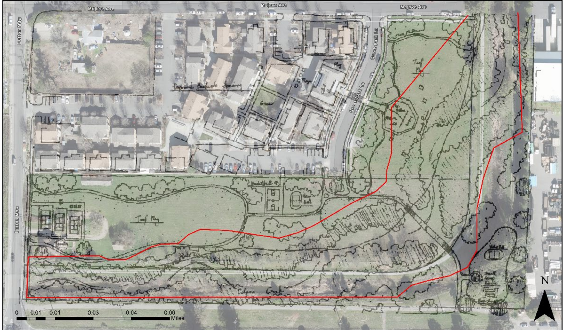
Lower Colgan Creek Park Master Plan Sketch and Creek Restoration Proposal Plan