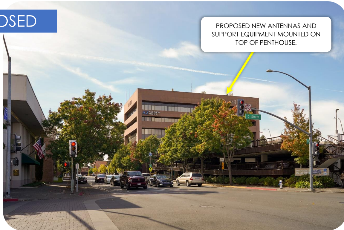
View 2: Looking West along 3 rd St. | Photosim produced 12/09/2021

PROPOSED NEW ANTENNAS AND SUPPORT EQUIPMENT MOUNTED ON TOP OF PENTHOUSE.