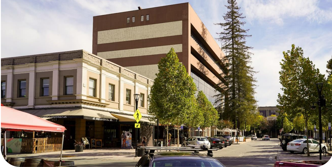
View 2: Looking Southeast from 4 th St.

PROPOSED NEW ANTENNAS AND SUPPORT EQUIPMENT MOUNTED ON TOP OF PENTHOUSE (NOT VISIBLE).