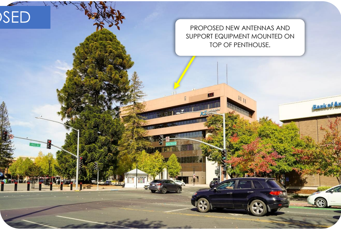
View 1: Looking Northeast along 3 rd St. | Photosim produced 12/09/2021

PROPOSED NEW ANTENNAS AND SUPPORT EQUIPMENT MOUNTED ON TOP OF PENTHOUSE.