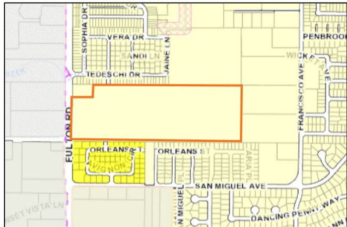
Figure 2: The project site is designated Low Density Residential.

The project site is designated Low Density Residential on the Santa Rosa General Plan 2035 land use diagram, which allows residential development at a density of 2 to 8 dwelling units per acre. Except for the Medium-Low density designation to the southwest, the parcels in the surrounding area share the same or similar land use