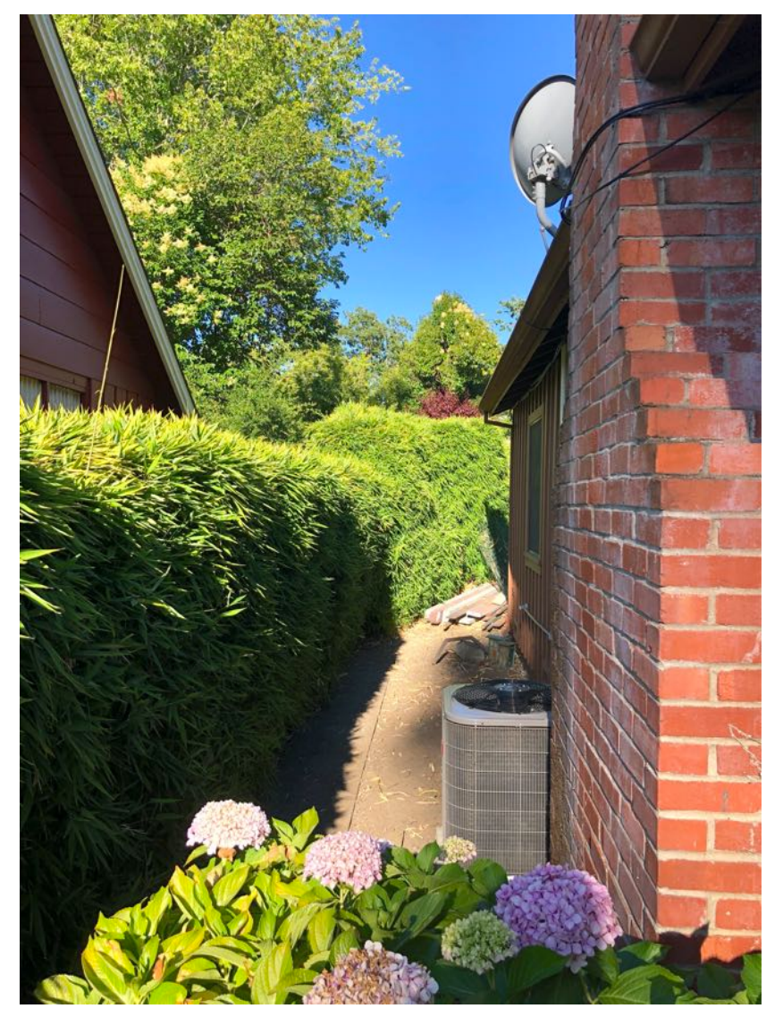
SIDE YARD : YIEW LOOKING EAST