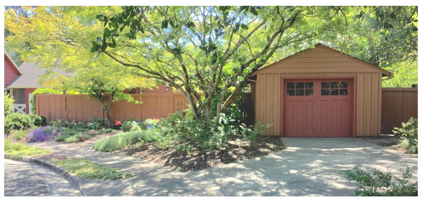
MONROE COURT : VIEW LOOKING EAST

Gary Moyer: Architect C-16838 1118 Monroe Court, Santa Rosa, CA 95404 (707) 529-6010 garymoyer1118@gmail.com