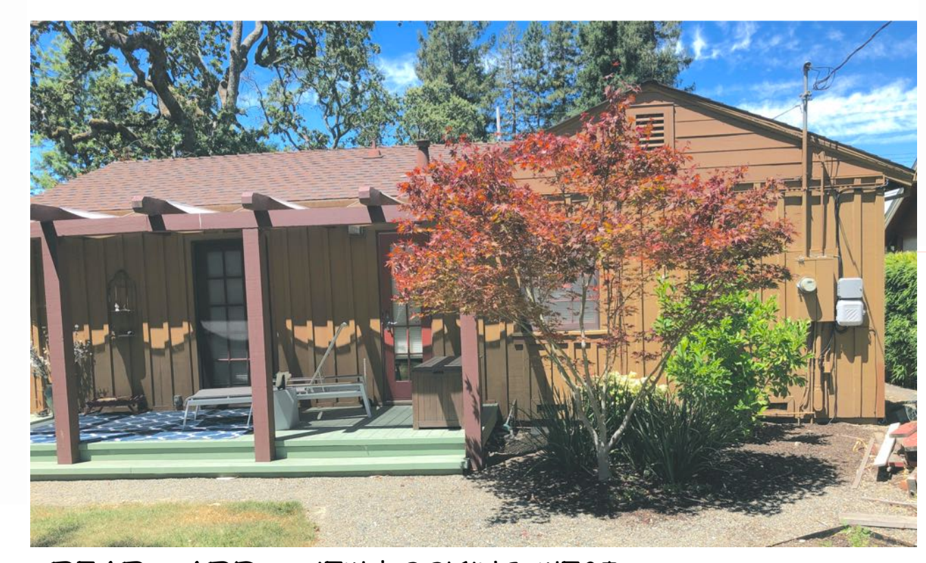
REAR YARD : YIEW LOOKING WEST