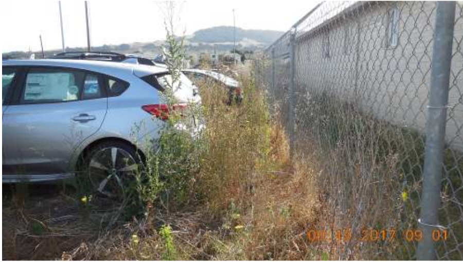
Fig. 2: Ruderal vegetation along southern boundary.