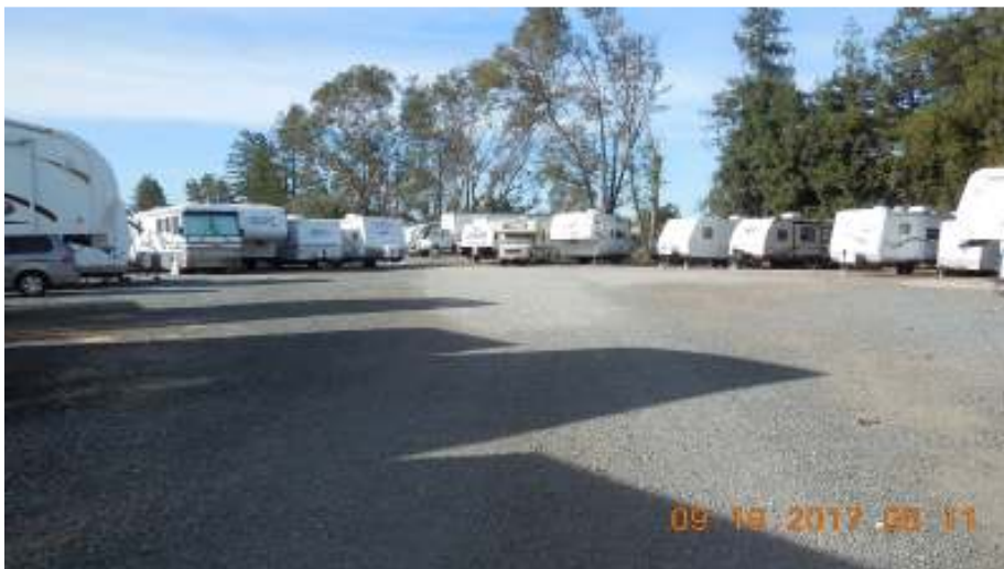
Fig. 4: Eucalyptus trees along western boundary.