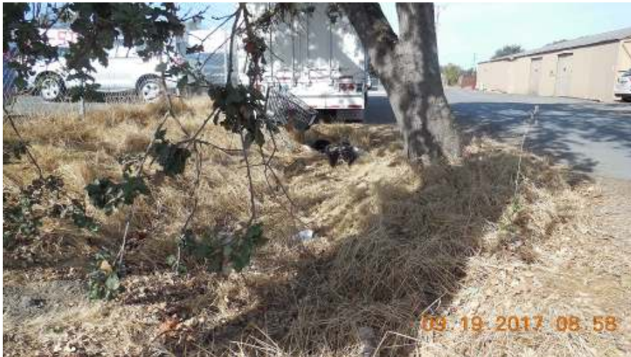
Fig. 3: Drainage ditch on Bellevue Avenue.