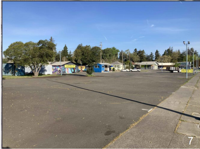
View of site from Southeast