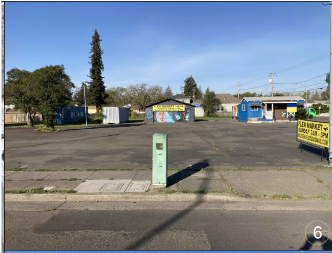
View of site from East