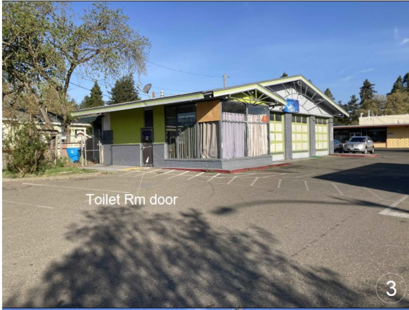
View of adjacent toilet room