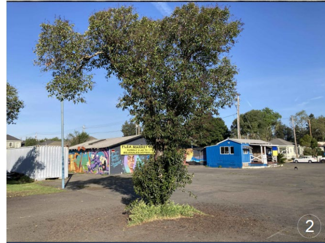
View of small tree