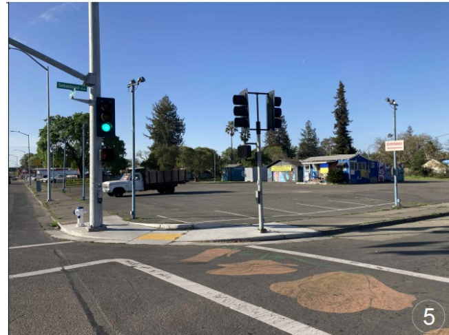
View of site from Northeast