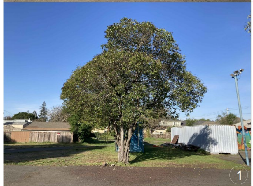
View of large tree