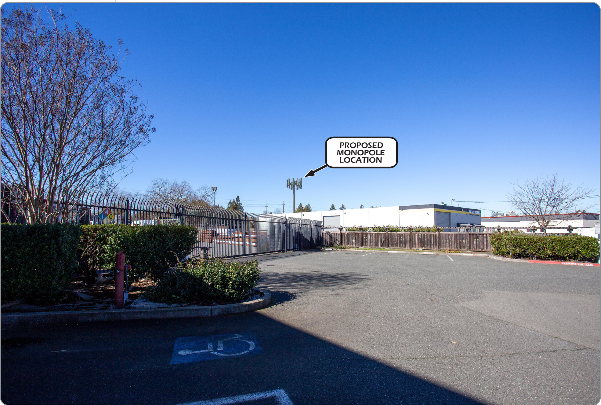
Completed February 14, 2021