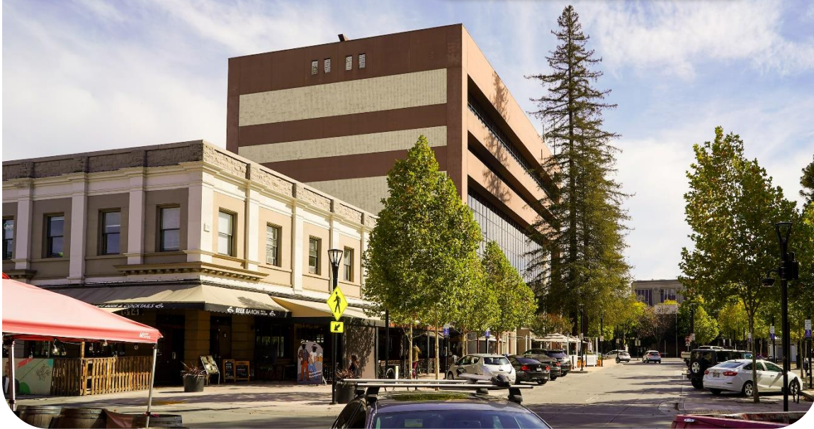
View 2: Looking Southeast from 4 th St.

PROPOSED NEW ANTENNAS AND SUPPORT EQUIPMENT MOUNTED ON TOP OF PENTHOUSE (NOT VISIBLE).