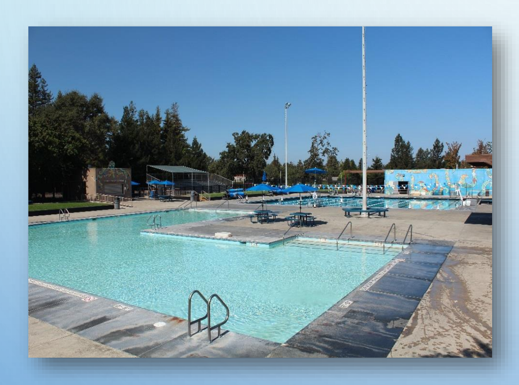
Finley Aquatic Center