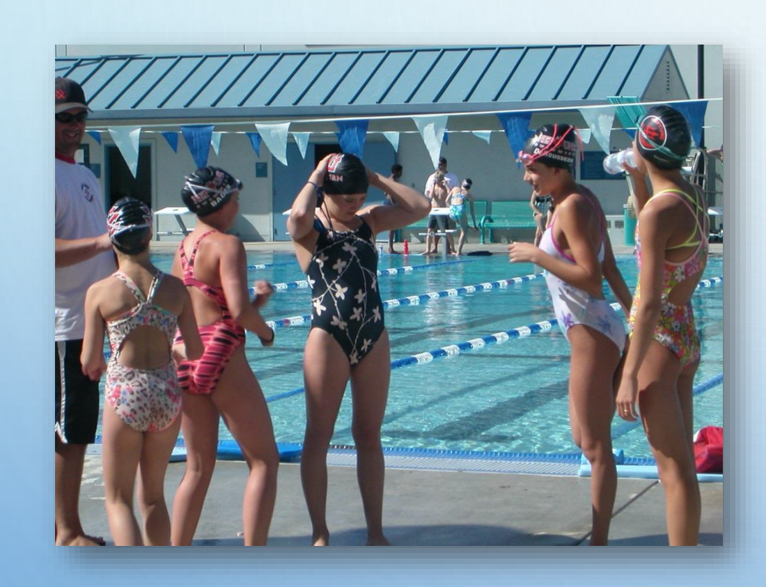
Neptune Swim Team