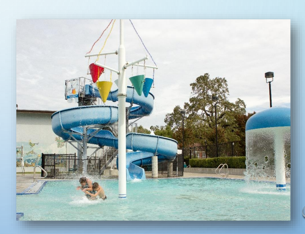
Ridgway Swim Center