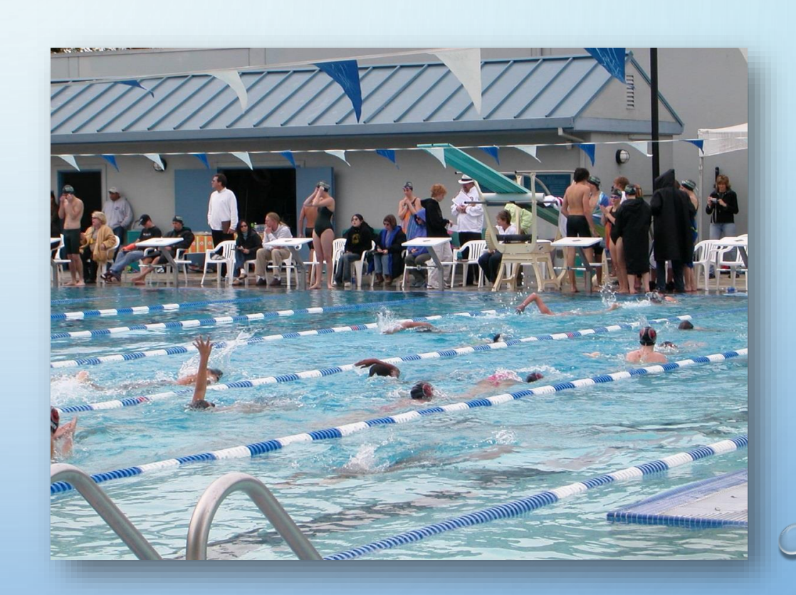
5 Santa Rosa City Schools + Cardinal Newman HS