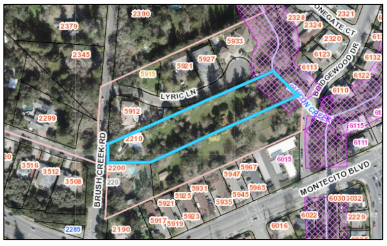
Figure 2: Aerial of surrounding properties.

There is an existing 1,470-square-foot singlefamily residence, and a 320-square-foot