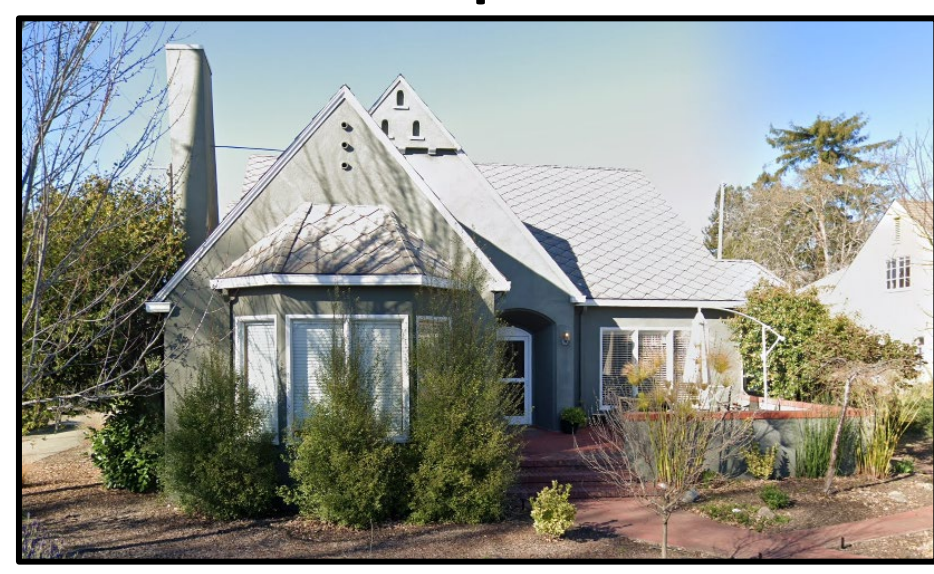
401 Denton Way