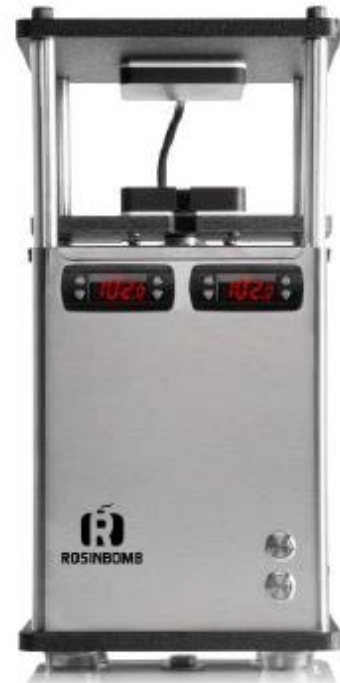
Figure 2: Rosinbomb extraction machine

The applicant proposes a mechanical extraction method called rosin press, which will be used for cold press extraction. The proposed cold-press system does not require the use of hazardous materials. The machine is fully electronic, and no solvents will be used. Per the project narrative, the device is compact yet delivers over 6,000 pounds of pressure with each press, which means no large footprint and no noise impact.