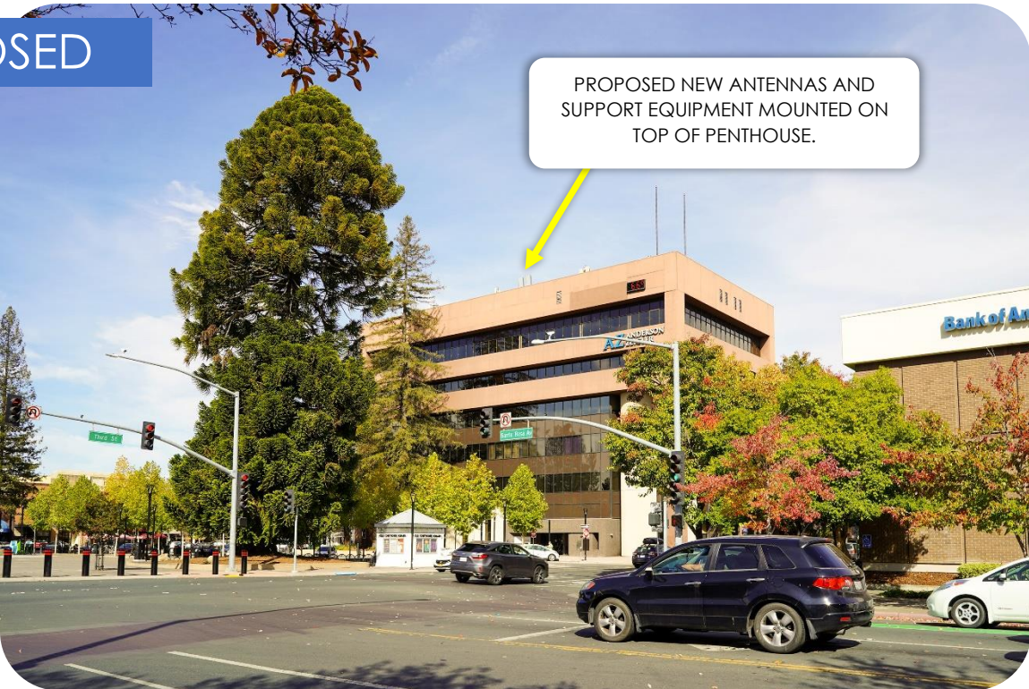
View 1: Looking Northeast along 3 rd St. | Photosim produced 12/09/2021

PROPOSED NEW ANTENNAS AND SUPPORT EQUIPMENT MOUNTED ON TOP OF PENTHOUSE.