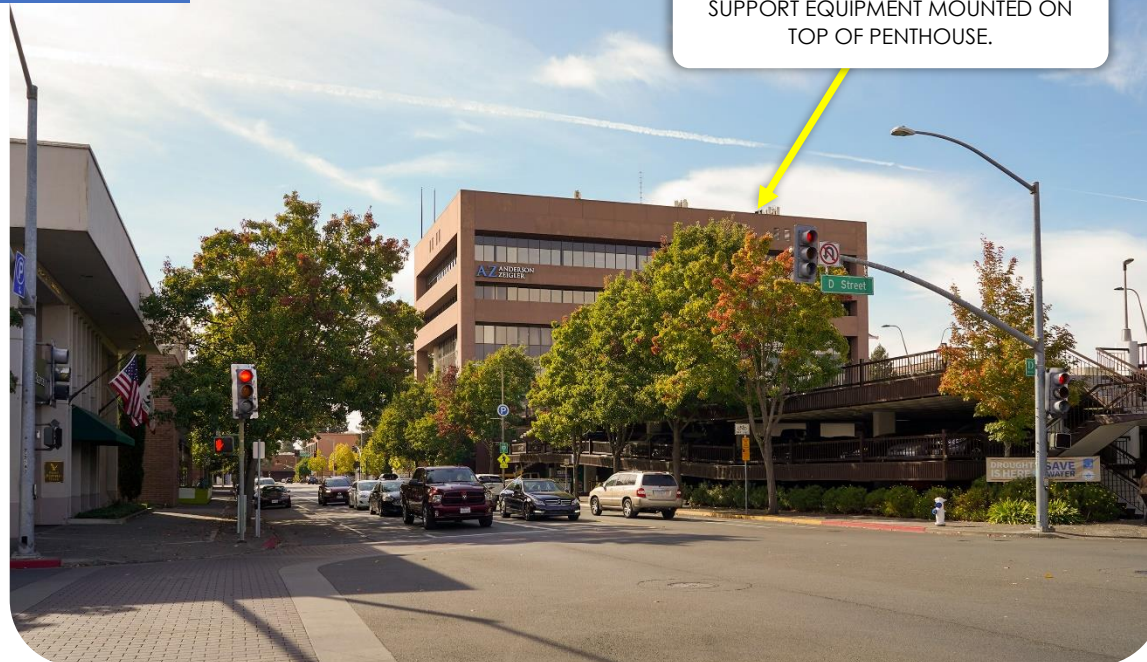
View 2: Looking West along 3 rd St. | Photosim produced 12/09/2021

PROPOSED NEW ANTENNAS AND SUPPORT EQUIPMENT MOUNTED ON TOP OF PENTHOUSE.