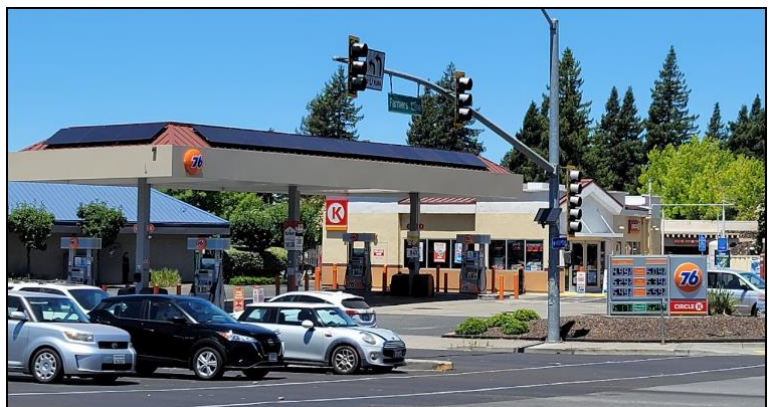
Figure 1 – Looking northwest from Farmer's Lane

The project proposes to allow the sale of beer and wine for off-site consumption at an existing Circle K store, with adjacent 76 service station. Pursuant to the State of California Alcoholic Beverage Control (ABC), a Type 20 License allows retail stores to sell beer and wine between 6:00 a.m. and 2:00 a.m.