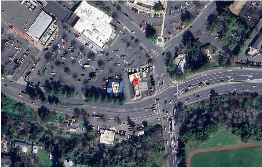
Figure 3 – Aerial view of project site and surrounding uses

The site is currently developed with an approximately 1,400 square foot convenience store, and eight self-serving fuel pumps.