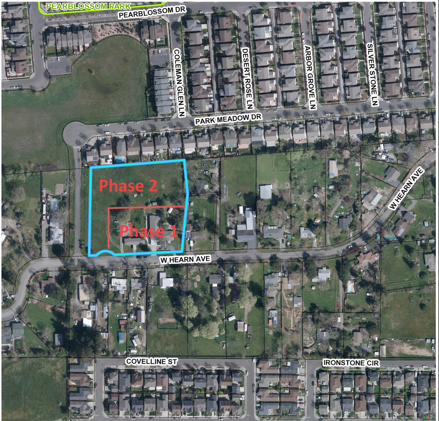
Approximate Phase 1 and 2 Locations