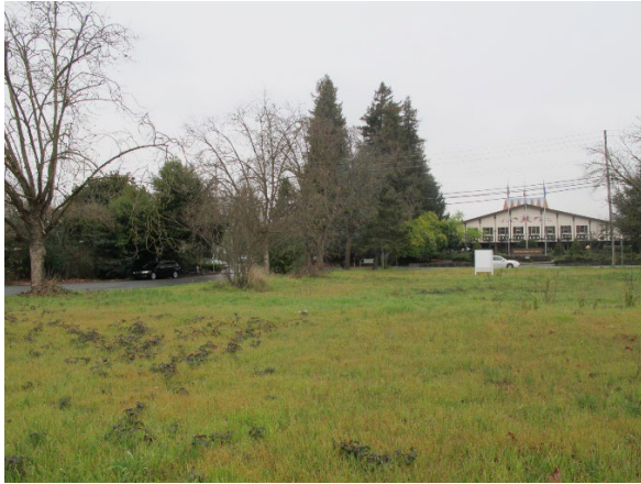
Site Interior looking north to ice rink