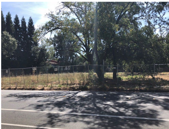
Site from West Steele Lane frontage