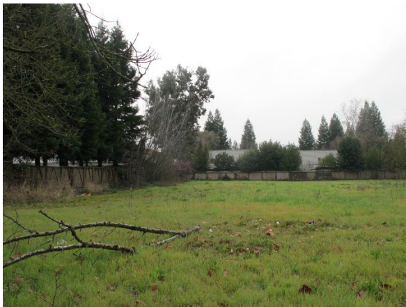
Site Interior looking south to apartments and carports