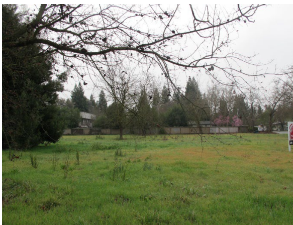
Site Interior looking west to apartments