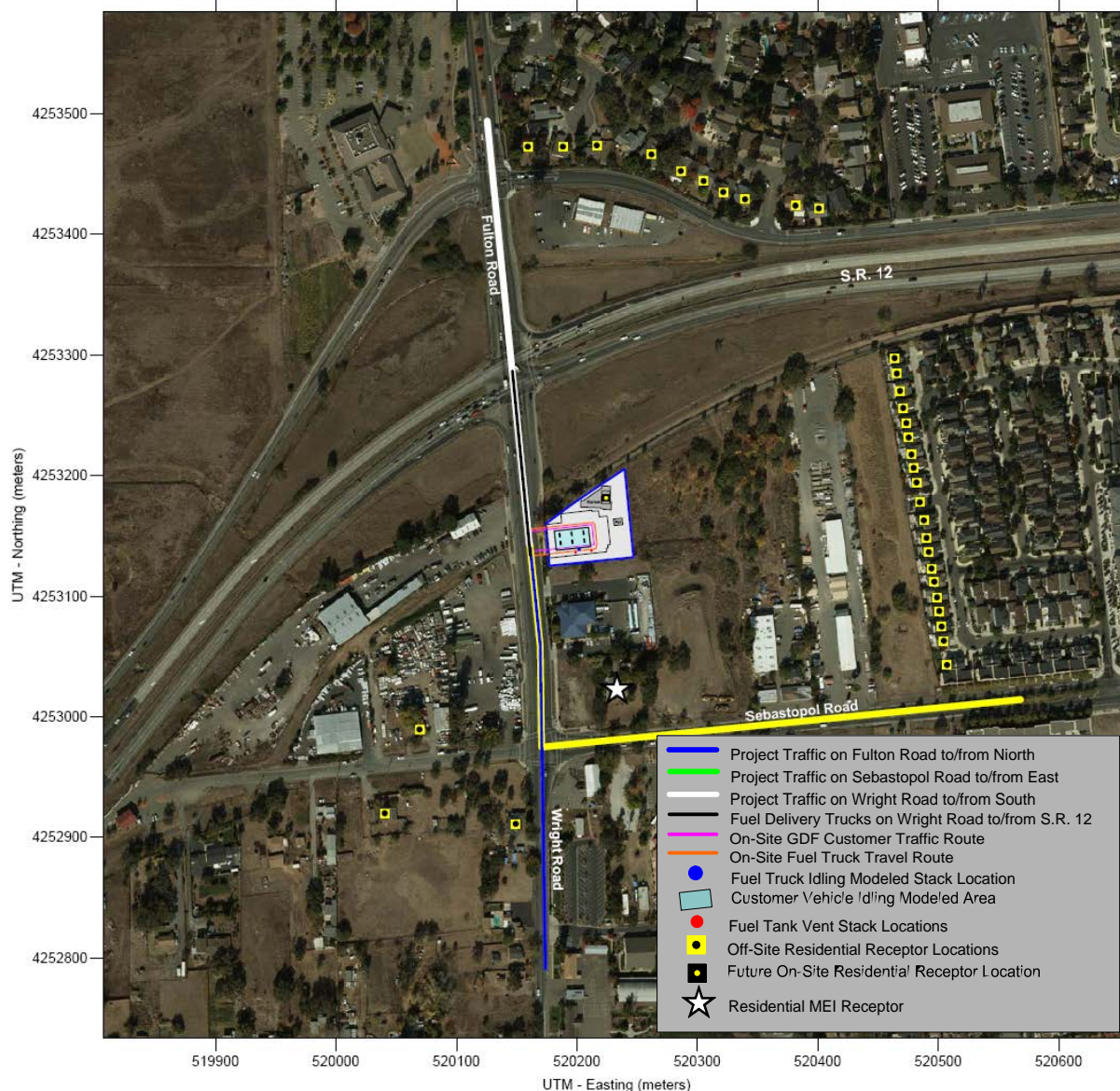
Figure 2. Project Site, Sensitive Receptor Locations, and Modeled Emission Sources