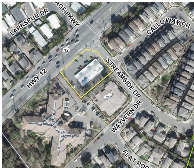
Figure 1: Location of Proposed Project Site

The Jane Dispensary (Project) proposes to operate a medical and adult use Cannabis dispensary with delivery within a 1,997-square-foot space within an existing 4,776-square-foot multi-tenant commercial building. The applicant proposes to operate the retail dispensary between the hours of 9:00 am and 9:00 pm, seven days a week, consistent with Zoning Code Section 20-46.080(F)(4). The applicant proposes to limit all commercial deliveries to the hours of 9:00 am to 5:00 pm, Monday through Friday.