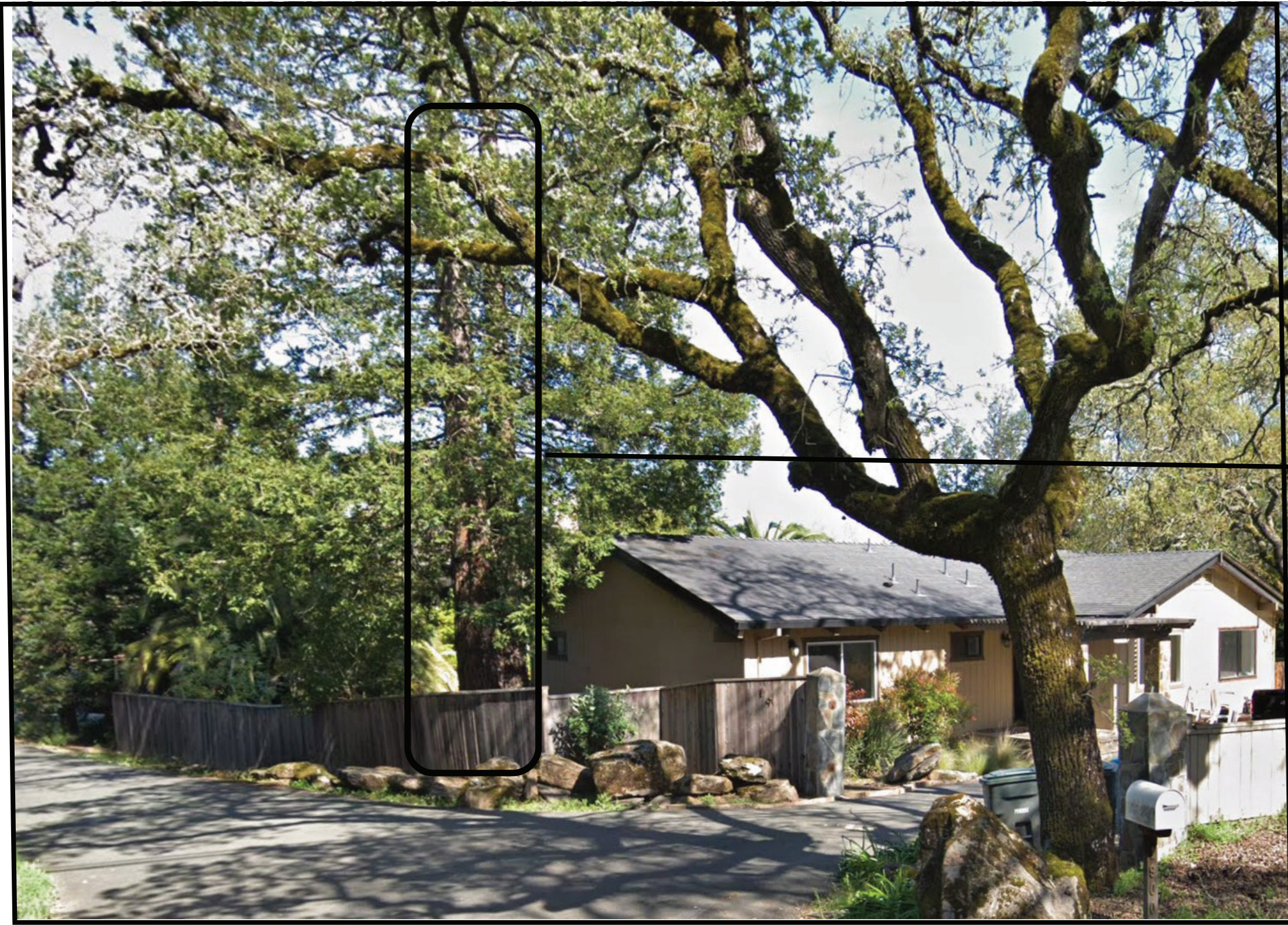
TREE TO BE REMOVED