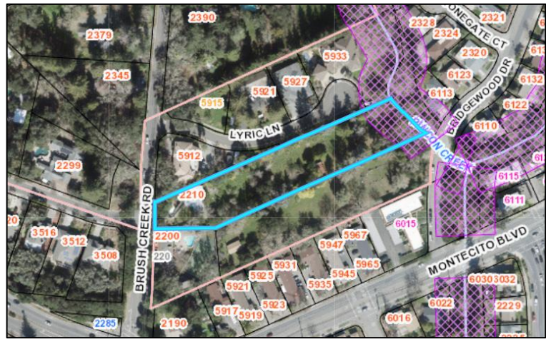
Figure 2: Aerial of surrounding properties.

The project site is located at 2210 Brush Creek Road, near the intersection of Brush Creek Road and Lyric Lane, approximately 350 feet north of Fountaingrove Parkway/Montecito Boulevard.