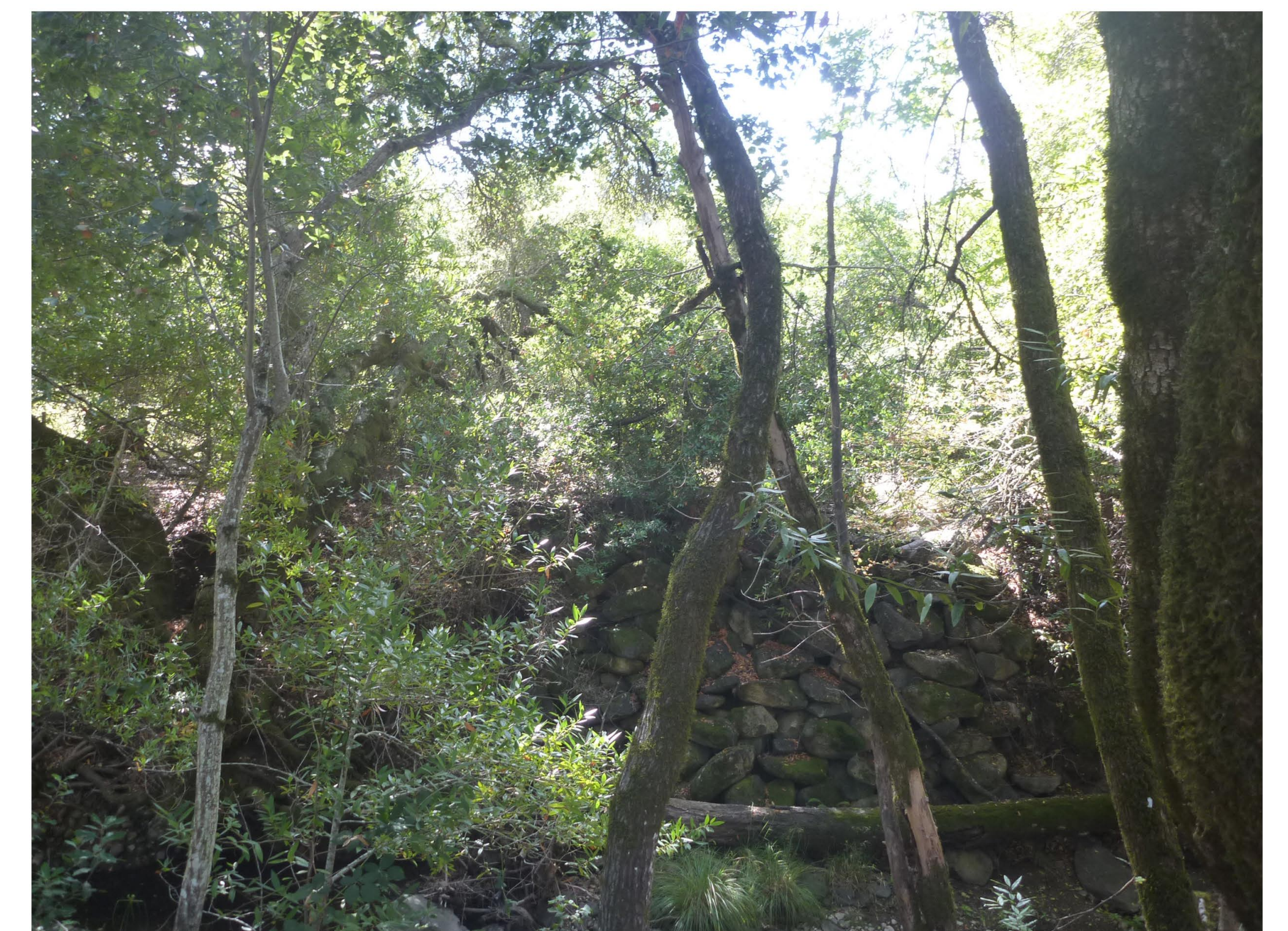
OAKMONT CREEK (PROPOSED BRIDGE LOCATION)