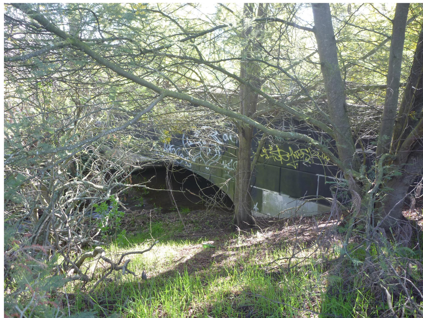
EXISTING BRIDGE OVER MELITA CREEK