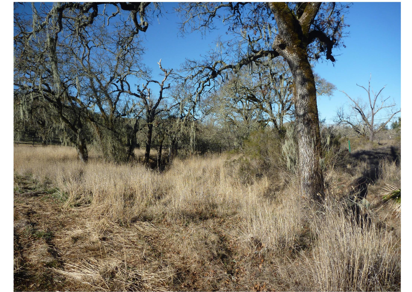
MELITA CREEK (PROPOSED BRIDGE LOCATION)