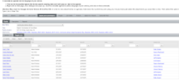
Screen Shot 2024-11-06 at 4.53.58 PM.png 238K