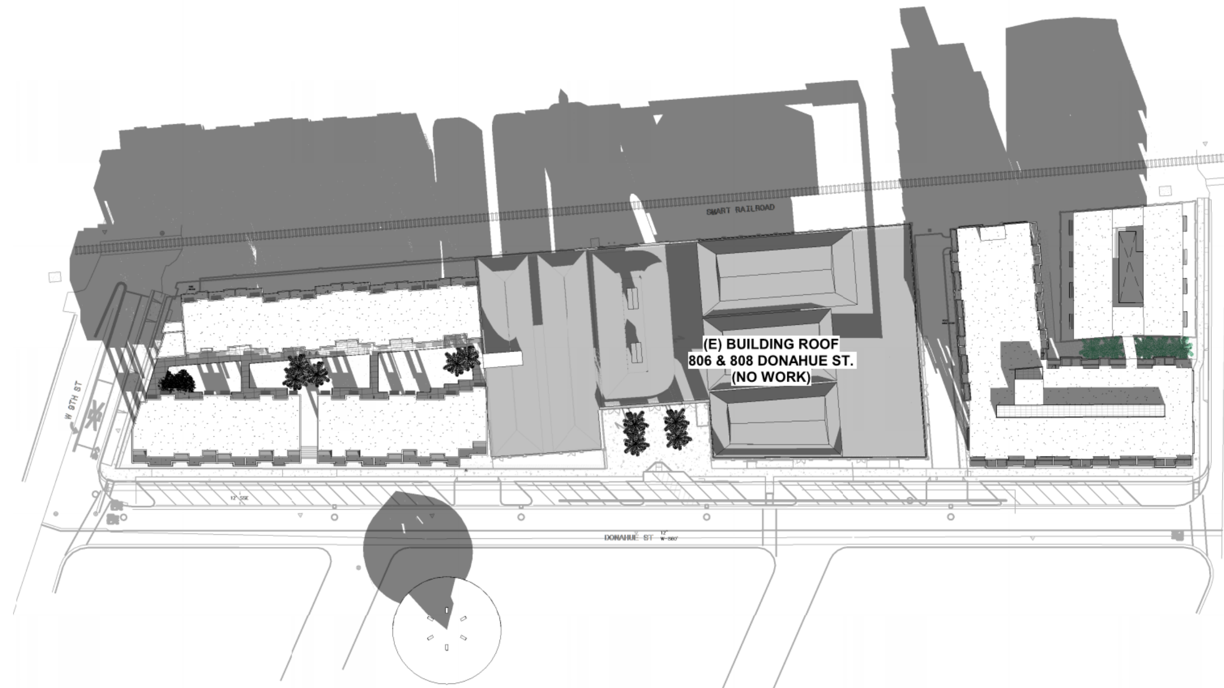
SHADOW STUDY - WINTER SOLSTICE - 3 PM

5/13/2019 3:22:36 PM BIM:360/15-043-Design-DeTurk Winery Village Apartments SITE.rvt