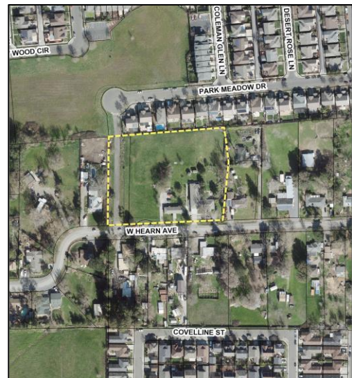
Figure 5: Aerial Map of project site.

Additionally, both the North Point Mitigation Site and the FEMA Site are designated as Open Space and located north and northwest of the site, respectively.