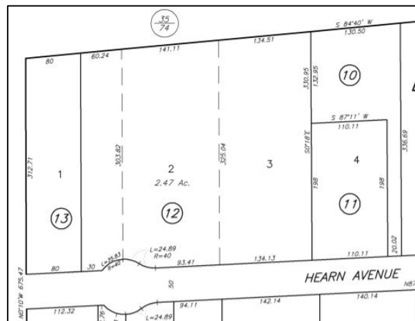
Figure 1: Assessor's Parcel Map showing current configuration for 134-011-012 & 013.

Community Housing Sonoma County (CHSC) is proposing to subdivide parcel 134-011-013 into four individual lots. In