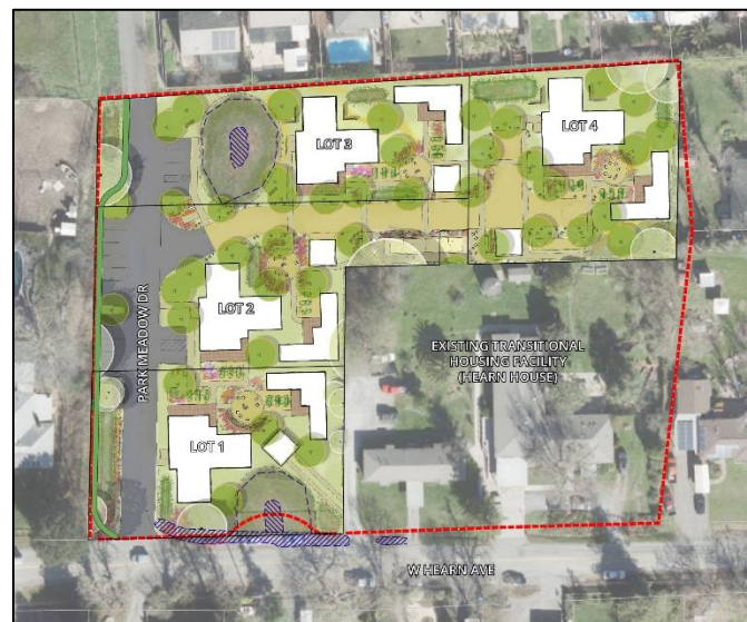
Figure 4: Proposed Parcels Configuration- Hearn Veterans Village