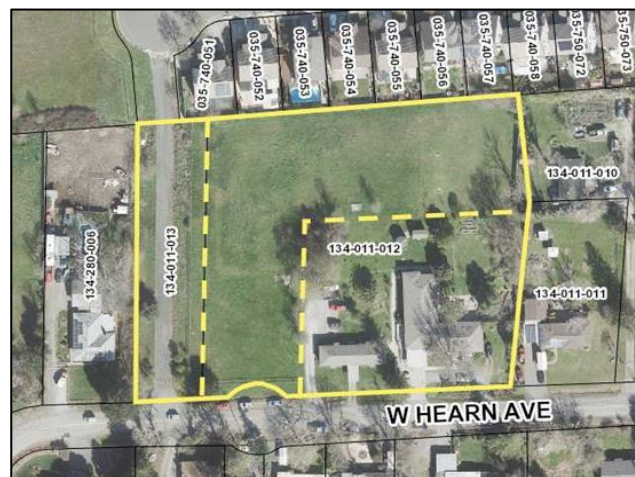
Figure 2: Lot Line Adjustment showing lot configuration for 134-011-012 & 013.