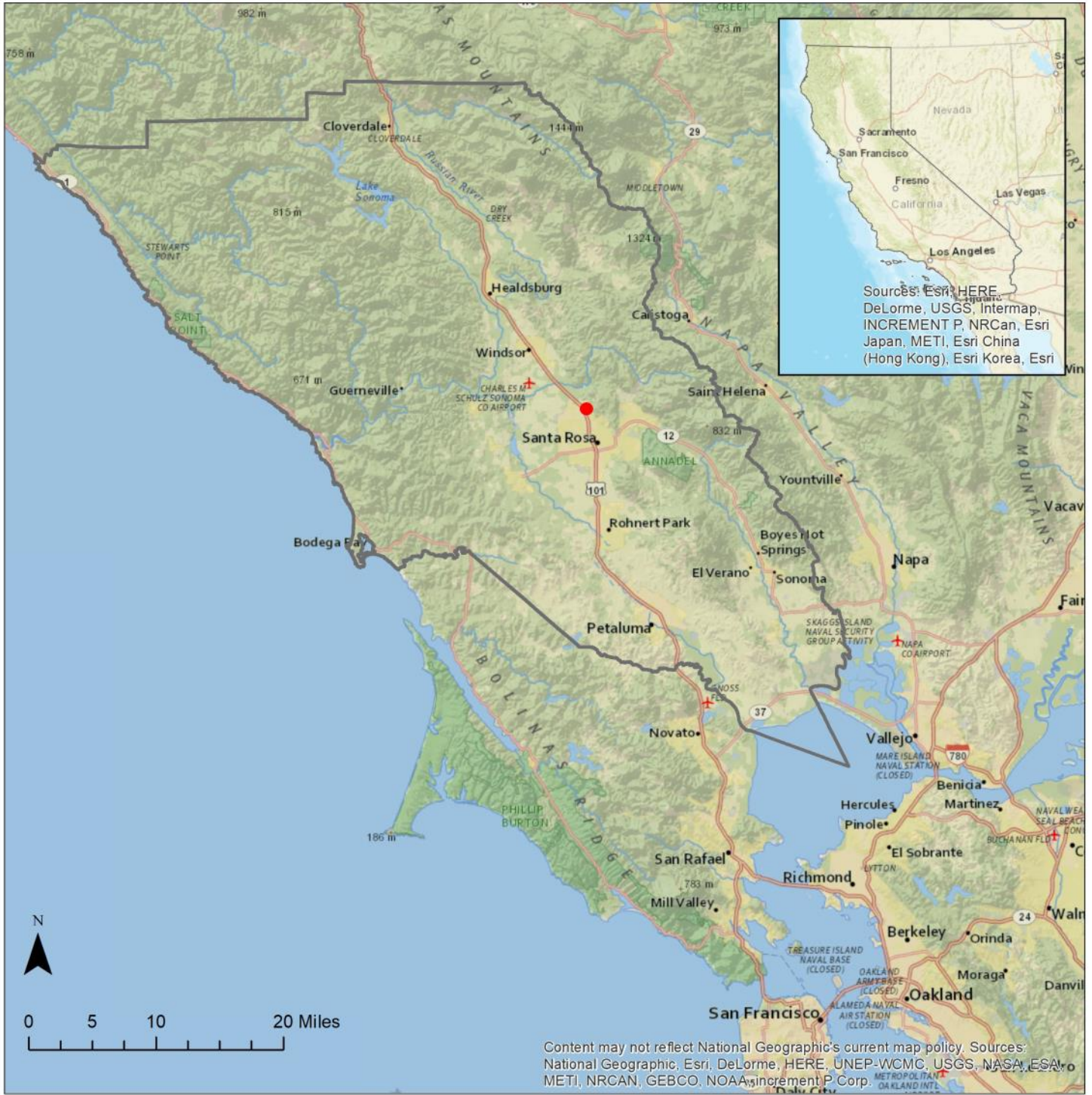
Figure 1: Project Location 3555 Round Barn Circle, Santa Rosa, CA