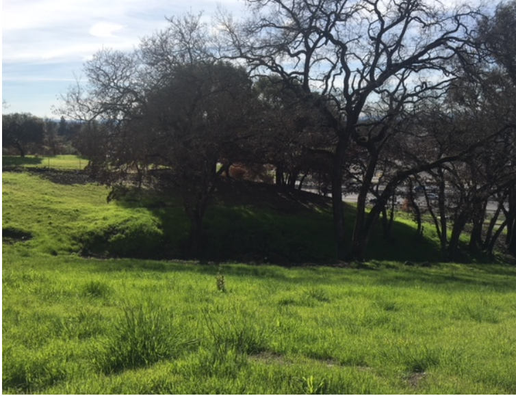
Western portion of site looking at remnant drainage – note burned vegetation