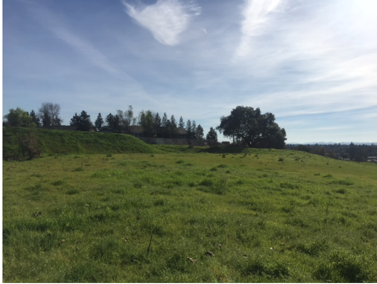
Looking south towards detention basin