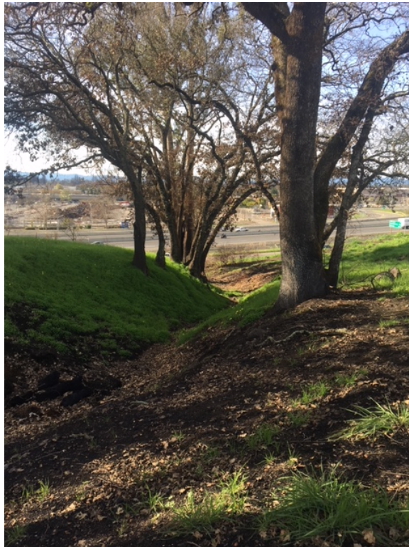
Looking downslope from top of remnant channel. Highway 101 is in background.