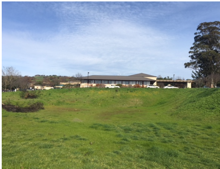
Previously graded detention basin – Round Barn Circle is in the background

On January 31, 2018, a jurisdictional wetlands delineation was conducted on the project site utilizing the methods and procedures prescribed in the Arid West supplement. The project site was walked to identify and map potential jurisdictional wetland features within the study area. No potential jurisdictional wetland features were identified within the proposed footprint 1 . A remnant creek channel was identified downslope of the proposed project but this channel will not be directly impacted as a result of construction. The channel supports a few native oaks however most of these were badly burned during the October 2017 fires that came through this area.