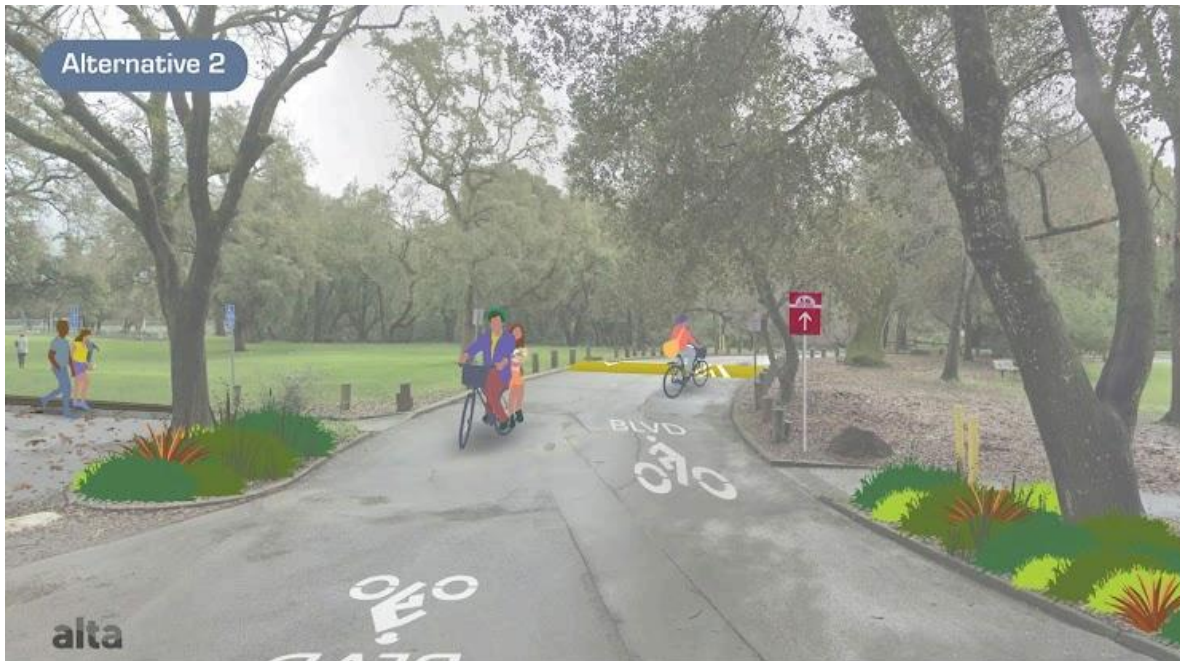
PHOTOSIM 2: DOYLE PARK DRIVE, LOOKING SOUTH

This alternative would have a protected bike lane on Sonoma Avenue as shown above, but instead of going all the way to Farmers Lane, bikes/pedestrians would be sent through Doyle Park's tree-lined paths and roads to Hoen Avenue where a neighborhood greenway would begin (refer to the next photo). This alternative would link through a great community park but would not be as direct as Alternative 1 may be.