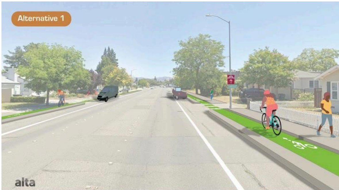
PHOTOSIM 1: SONOMA AVE APPROACHING CHURCH ST, LOOKING EAST

Note that this alternative plans to preserve parking on both sides of Sonoma Avenue, but a few spots may need to be removed for site distance at driveways and to have areas for trash pick-up and mail delivery. This option would provide a separated space for bikes, a buffer for pedestrians, would maintain driveway access, and parking, while also slowing vehicle speeds and reducing vehicle collisions.