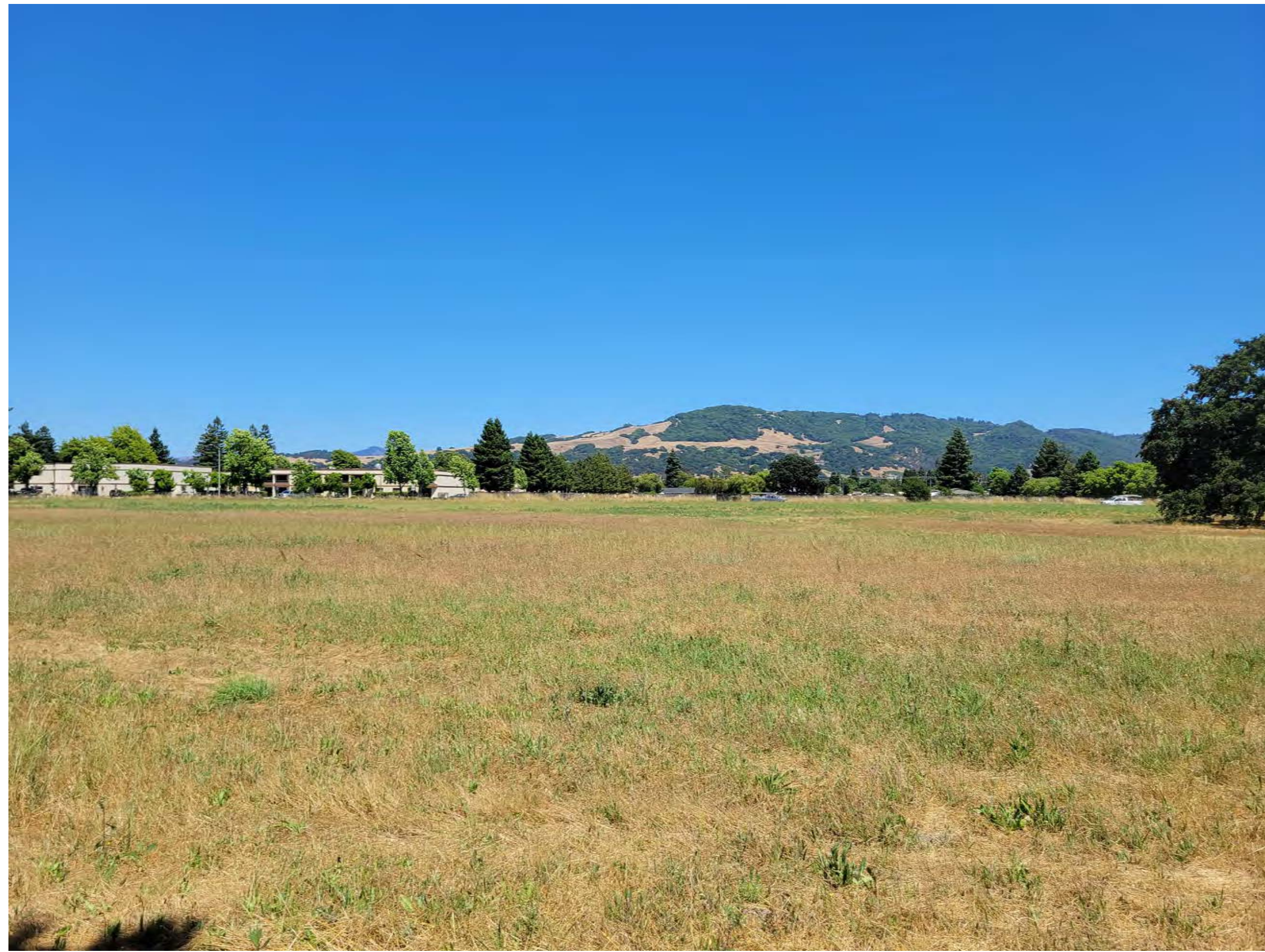
SITE PHOTO—VIEW #9 FROM HENHOUSE LOOKING EAST