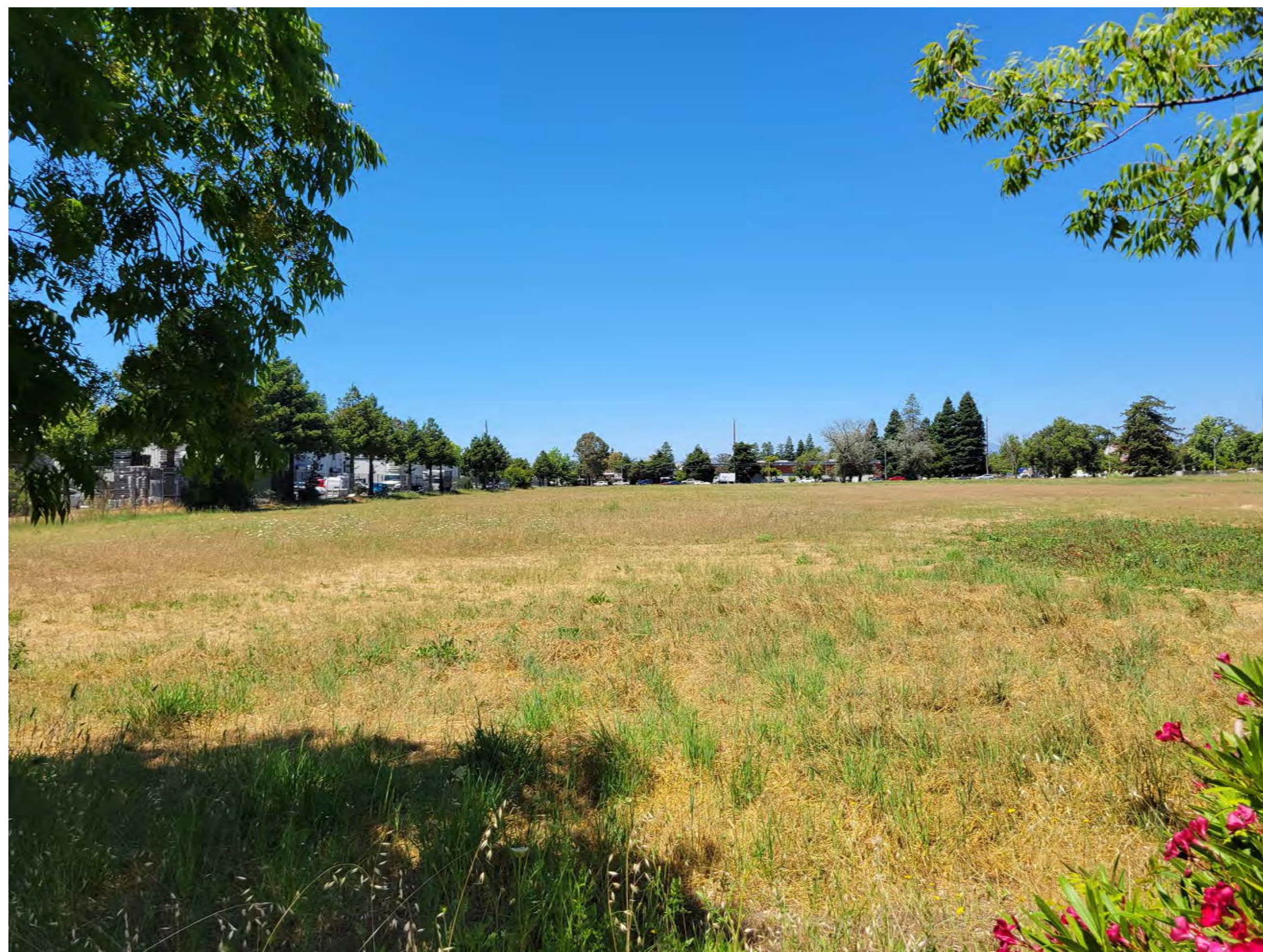
SITE PHOTO—VIEW #13 FROM STORAGE MASTER LOOKING NORTH