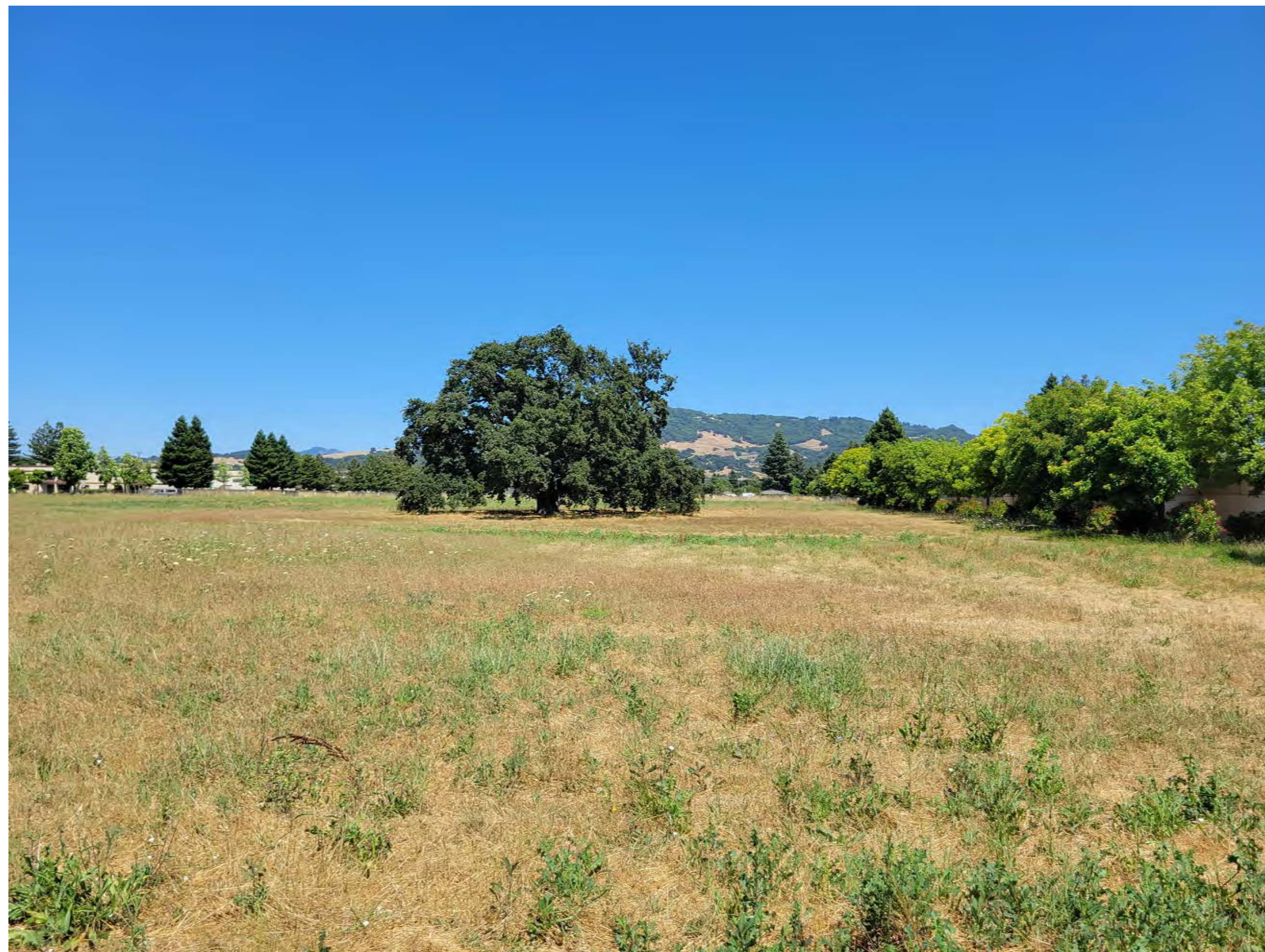
SITE PHOTO—VIEW #11 FROM HENHOUSE LOOKING EAST