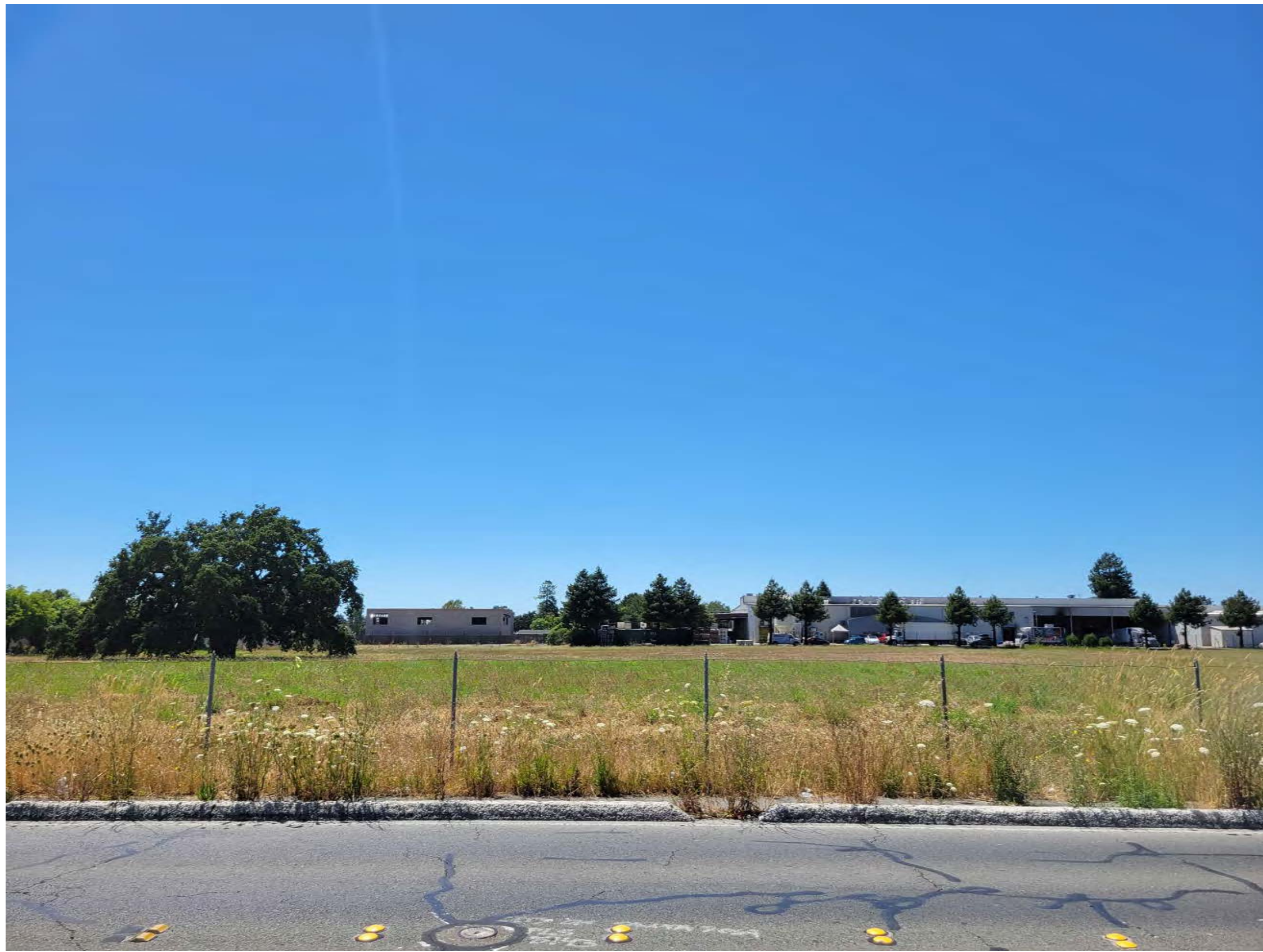
SITE PHOTO-VIEW #18 FROM DUTTON LOOKING WEST