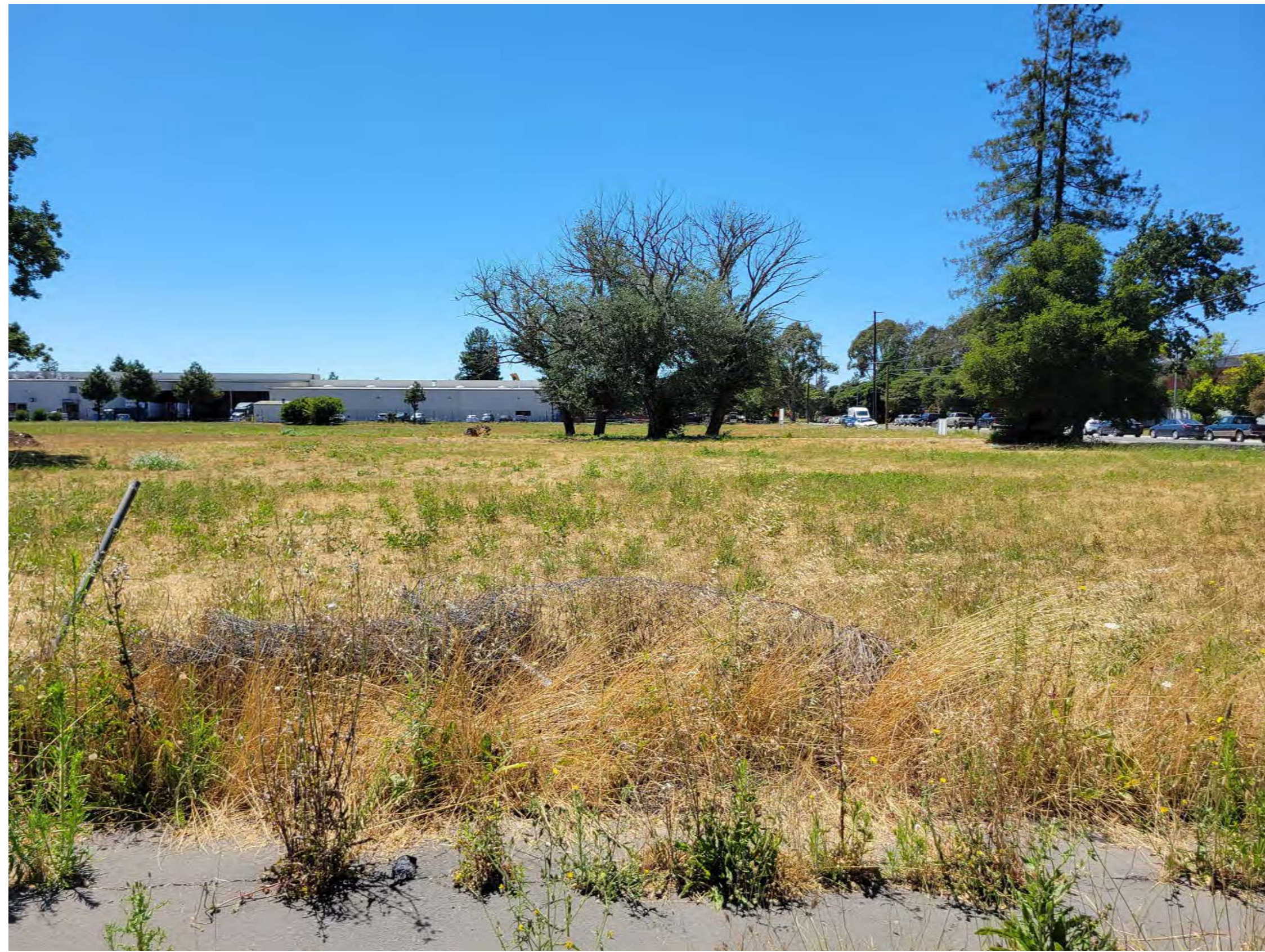
SITE PHOTO-VIEW #1 FROM DUTTON LOOKING WEST