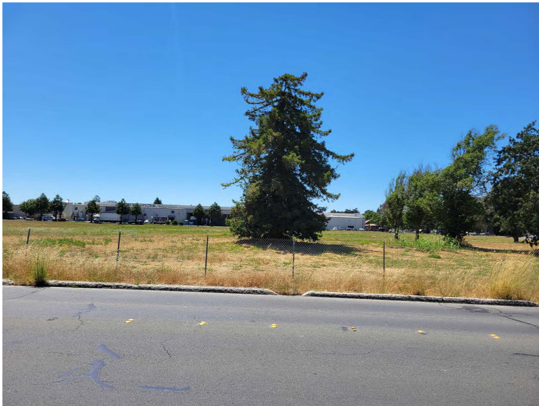
SITE PHOTO-VIEW #20 FROM DUTTON LOOKING WEST