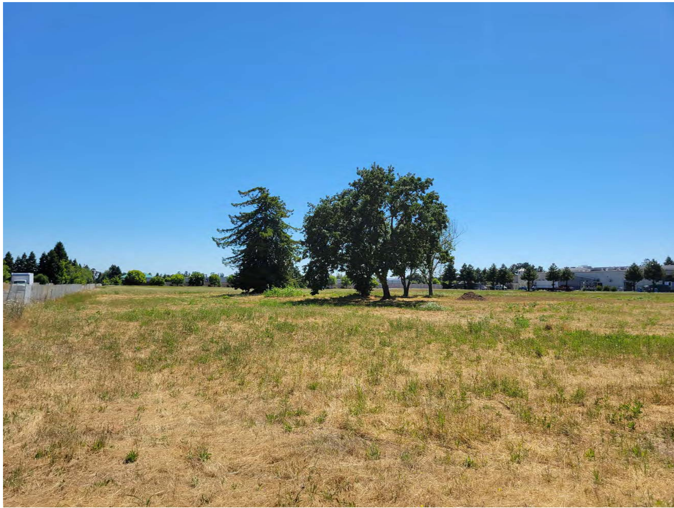
SITE PHOTO-VIEW #2 CORNER OF DUTTON AND BELLEVUE LOOKING SOUTHWEST