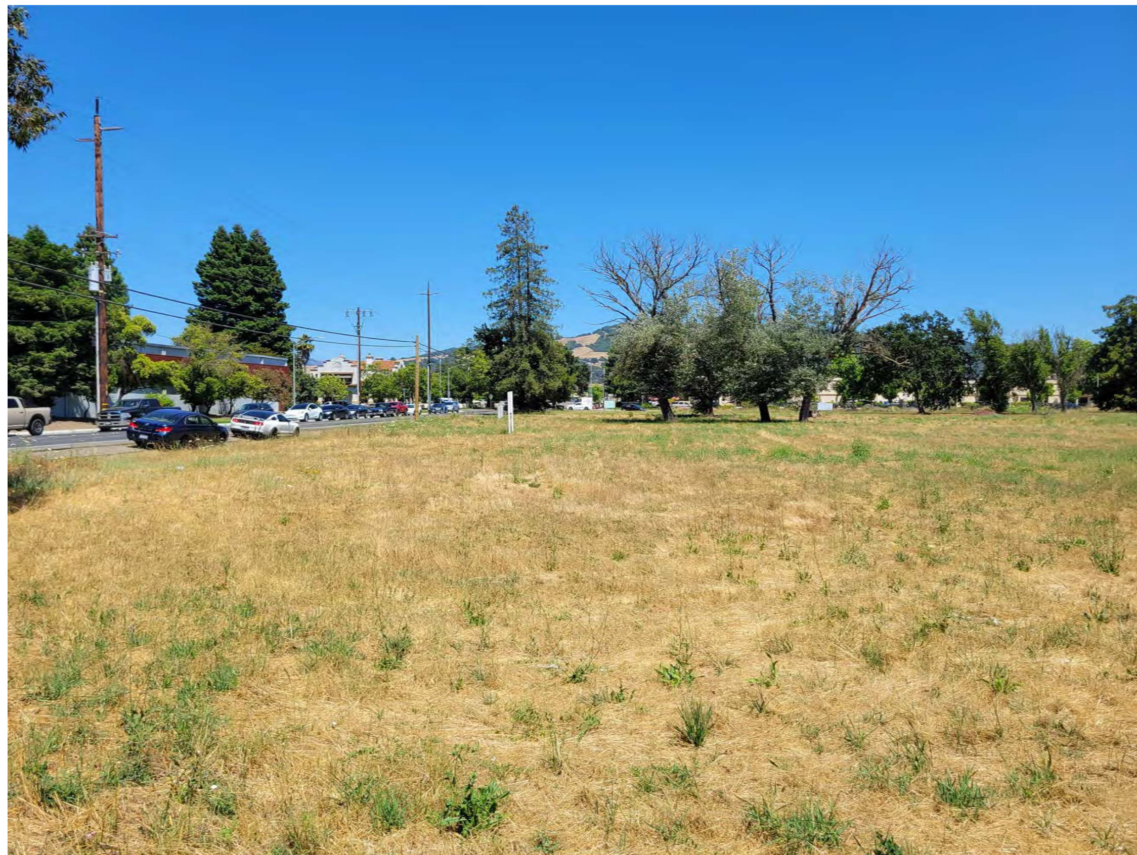
SITE PHOTO-VIEW #7 FROM HENHOUSE LOOKING EAST