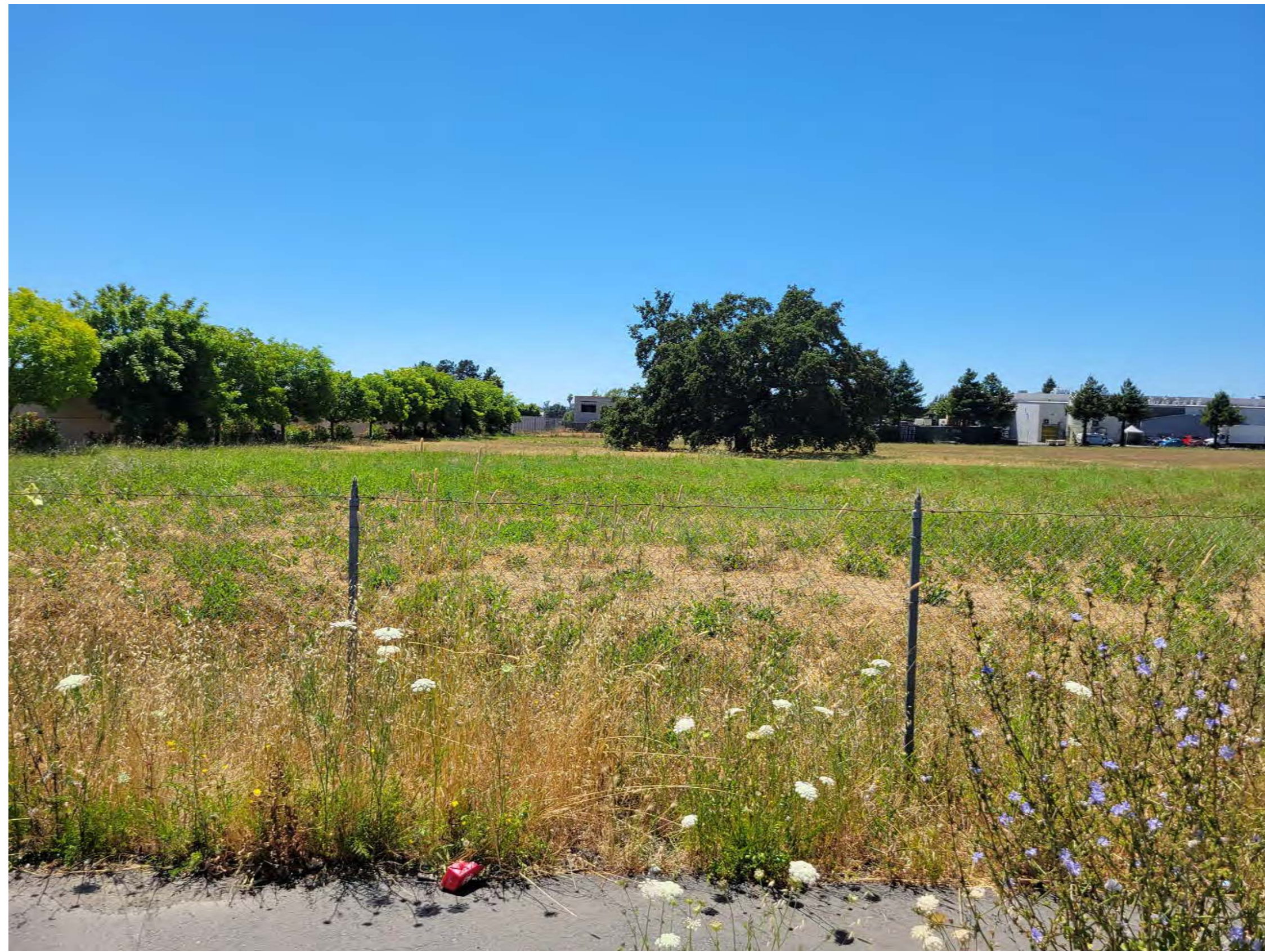
SITE PHOTO-VIEW #17 FROM DUTTON LOOKING WEST