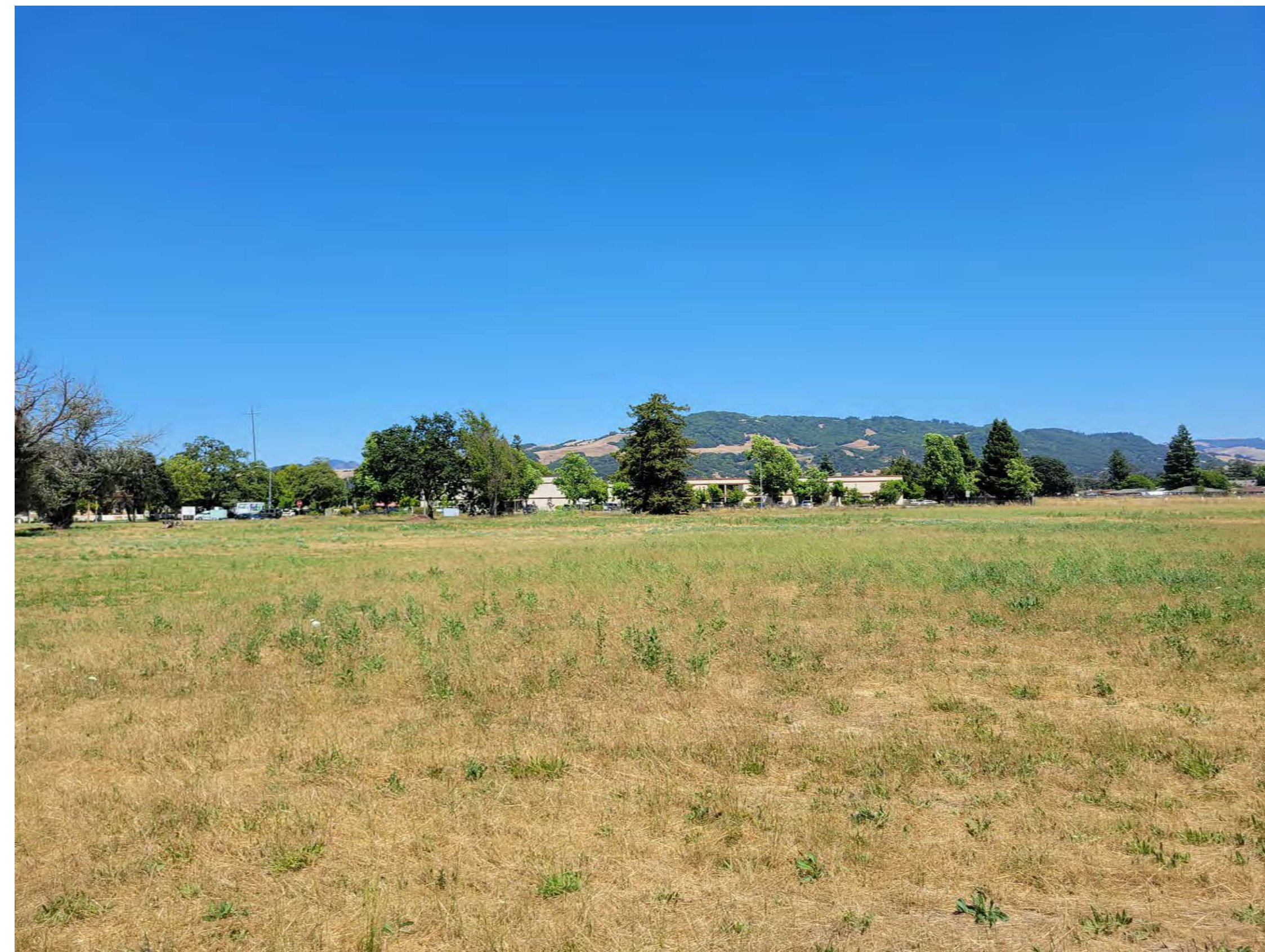
SITE PHOTO-VIEW #8 FROM HENHOUSE LOOKING EAST