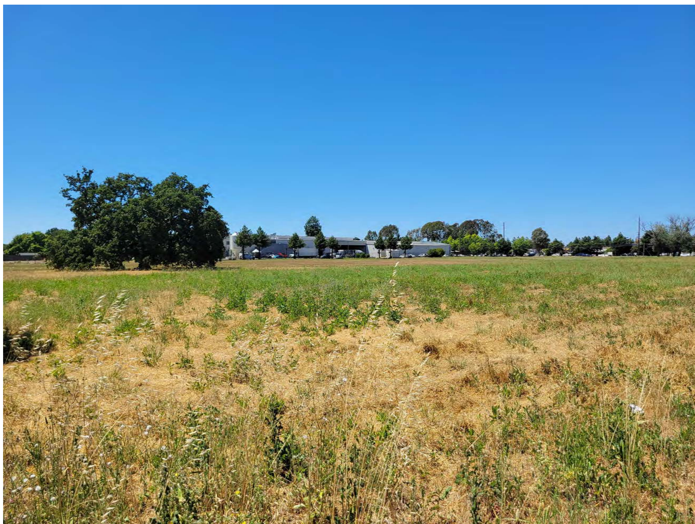
SITE PHOTO—VIEW #16 FROM STORAGE MASTER LOOKING NORTHWEST