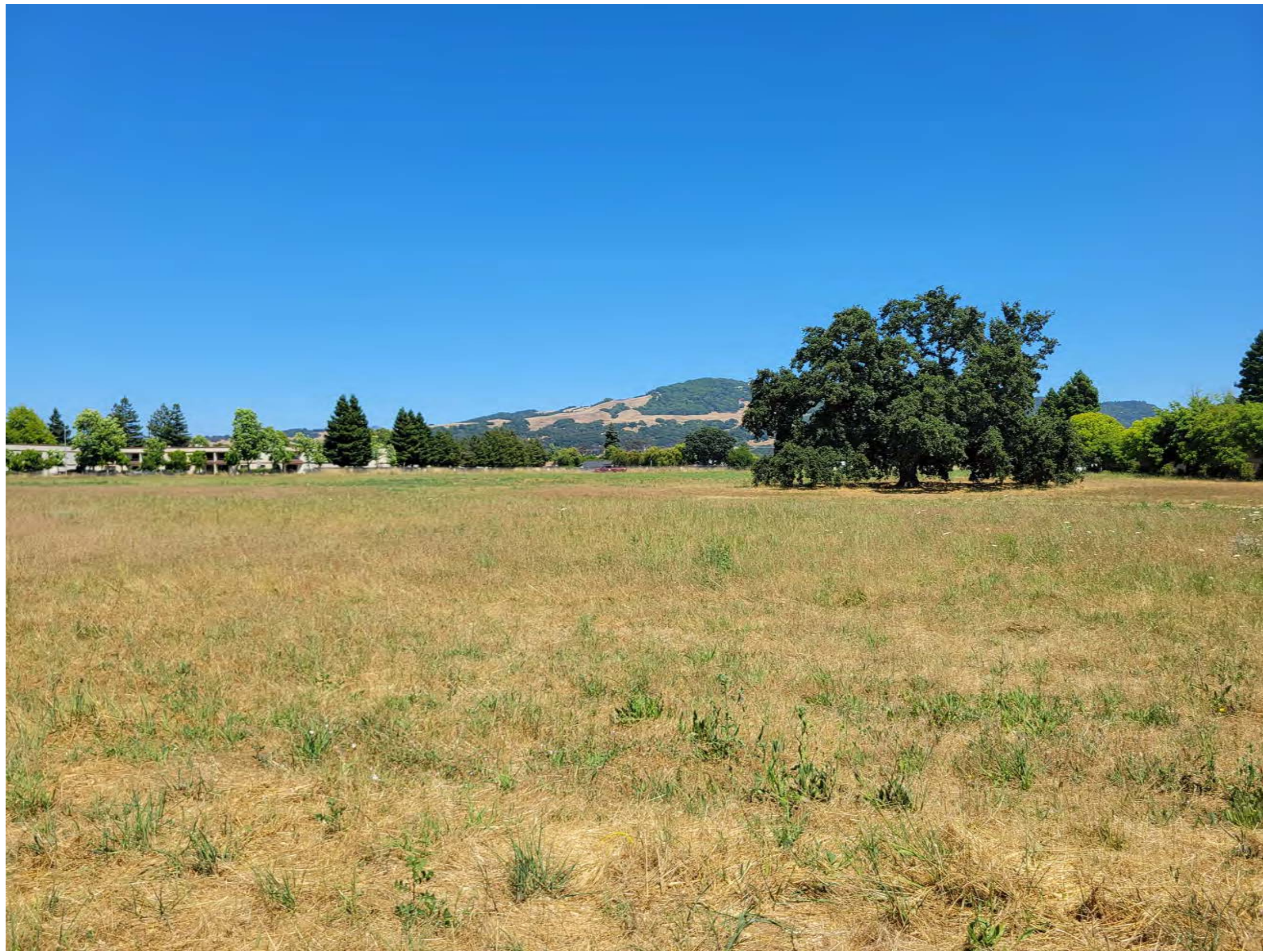
SITE PHOTO—VIEW #10 FROM HENHOUSE LOOKING EAST