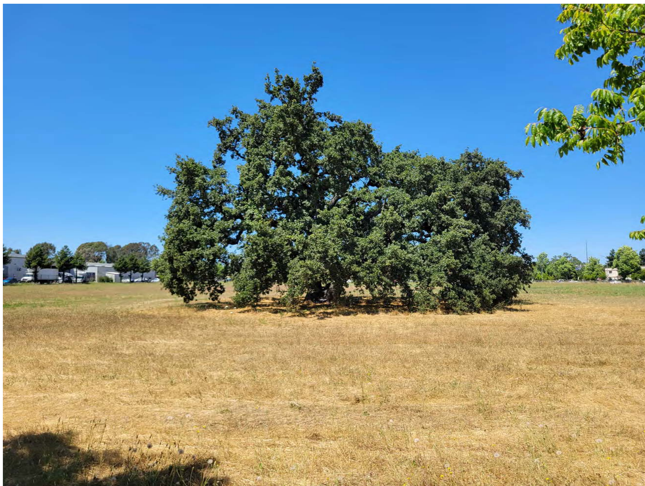
SITE PHOTO—VIEW #14 FROM STORAGE MASTER LOOKING NORTH