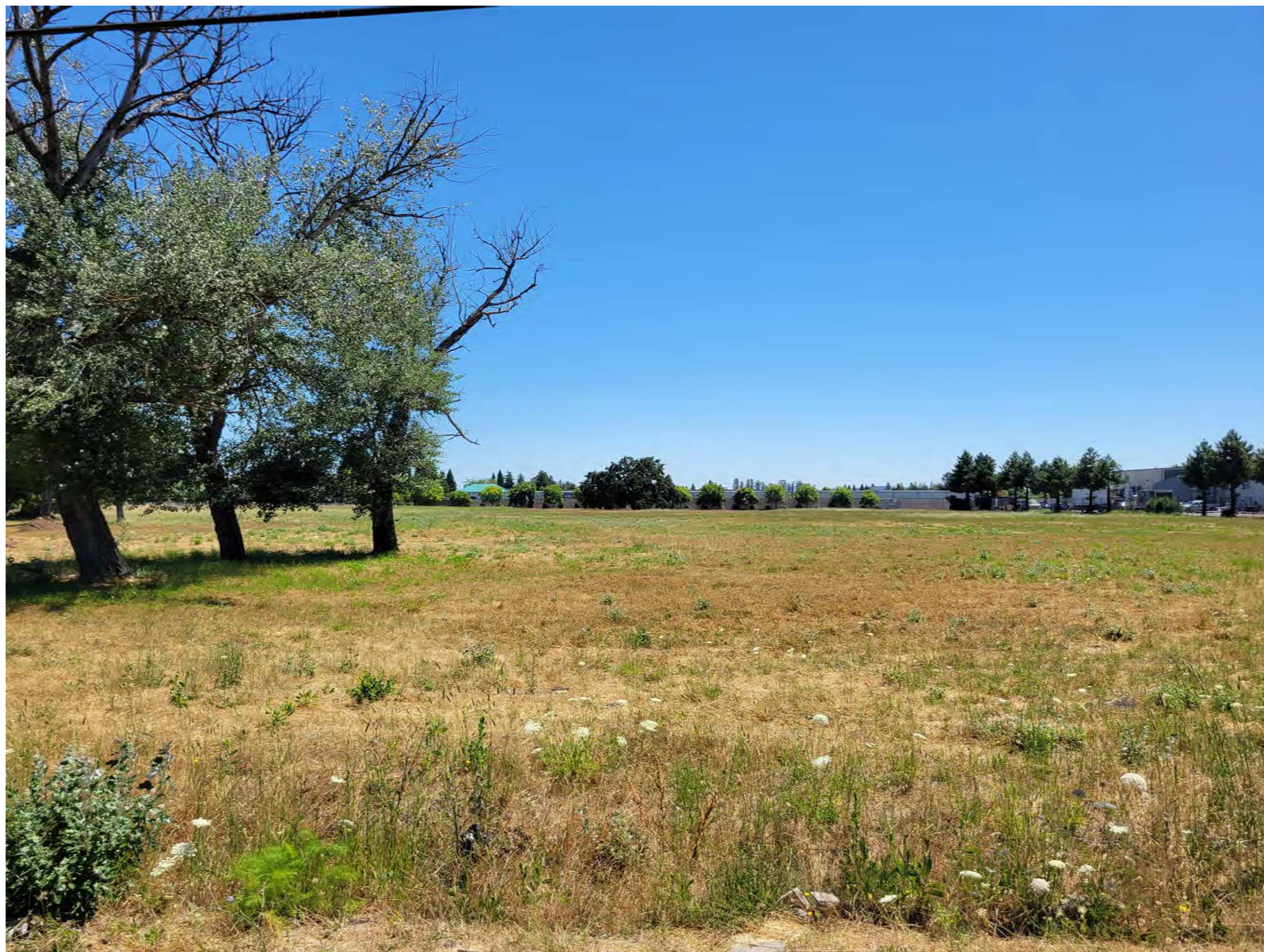
SITE PHOTO-VIEW #4 FROM BELLEVUE LOOKING SOUTH

bhills architecture bhills architecture, PC 3156 south bowen way boise | idaho | 83706 p. 208.258.6150 www.bhillsarch.com