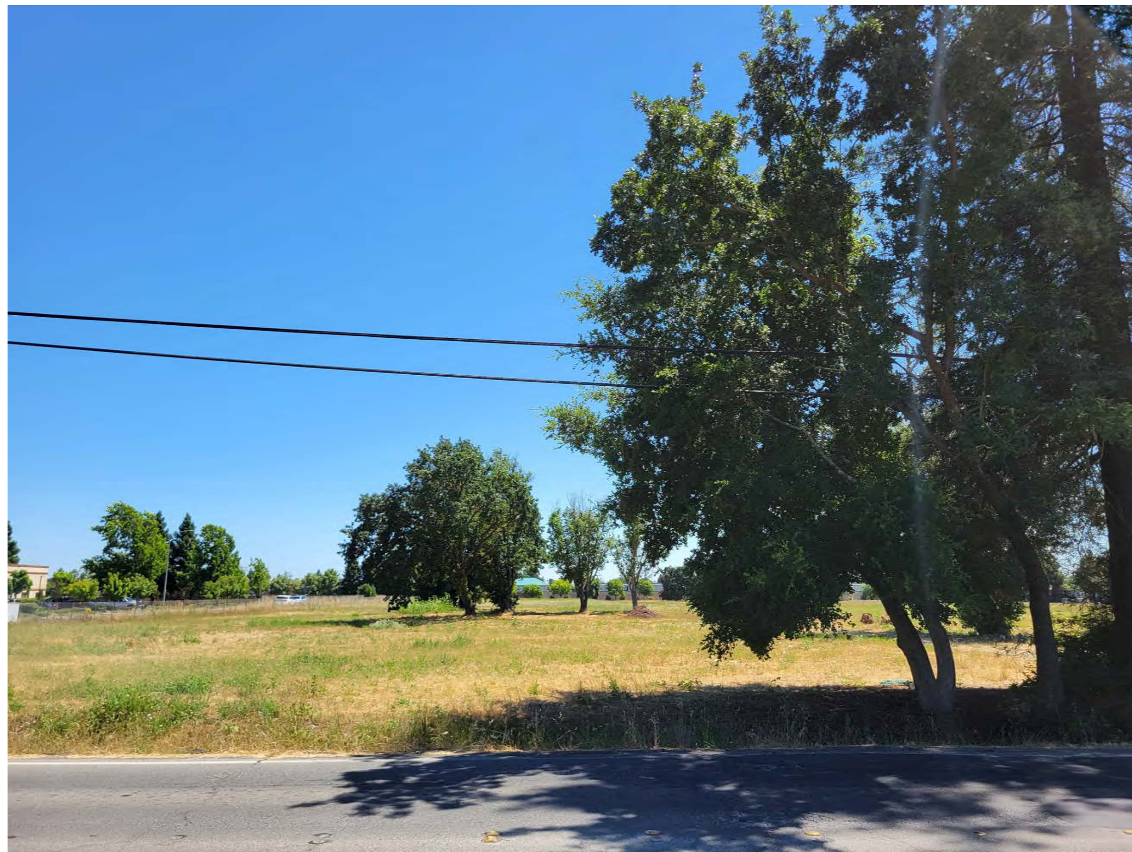
SITE PHOTO-VIEW #3 FROM BELLEVUE LOOKING SOUTH