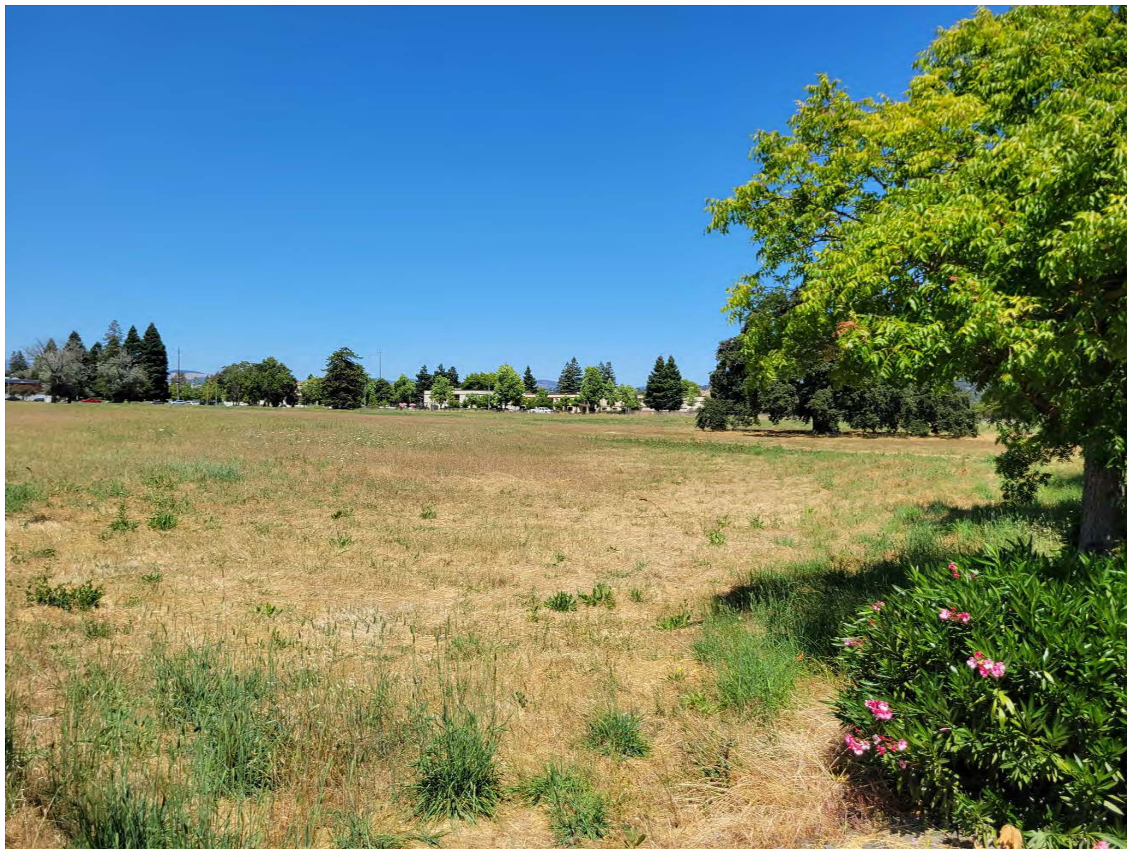
SITE PHOTO—VIEW #12 FROM HENHOUSE LOOKING NORTHEAST