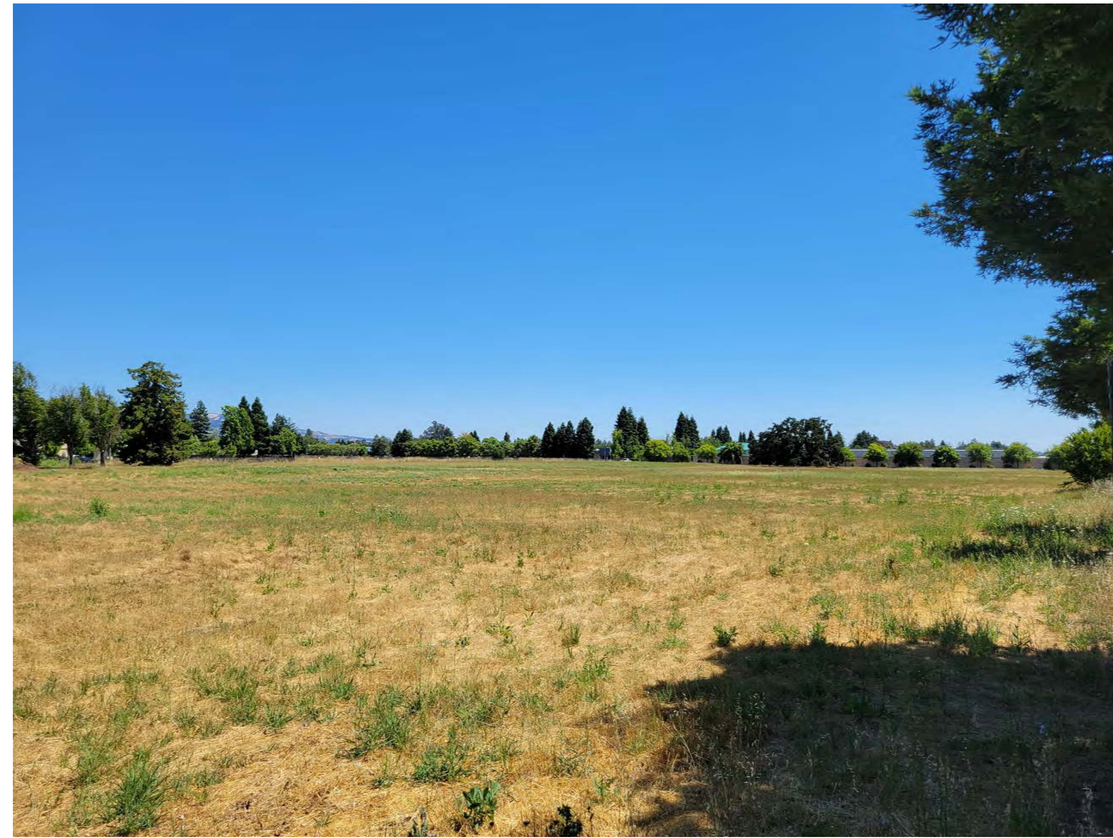
SITE PHOTO-VIEW #6 FROM BELLEVUE LOOKING SOUTHEAST