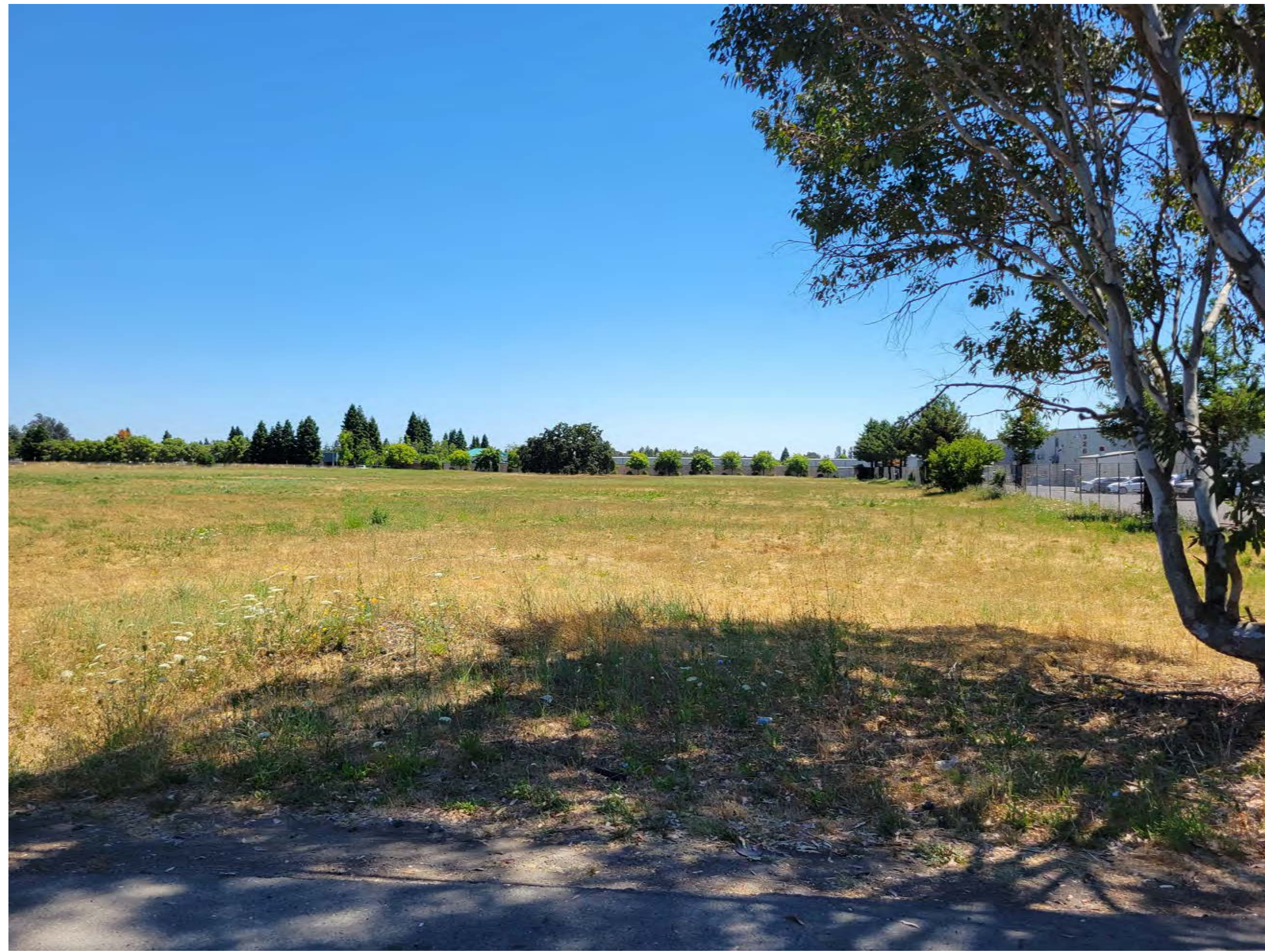
SITE PHOTO-VIEW #5 FROM BELLEVUE LOOKING SOUTH