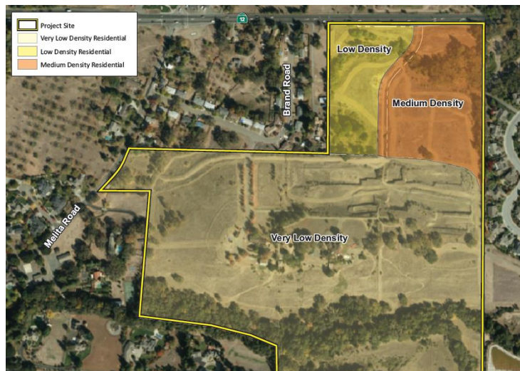
Figure 2: Project site General Plan designation.

The site’s current General Plan designations were established in 2002 as part of the 2002 comprehensive General Plan update. Prior to 2002, the entire 68-acre site was designated for Very Low Density Residential. As part of the 2002 update, approximately 9.2 acres of the project site were designated Medium Density Residential, and areas of the site west of Elnoka Lane and north of Road A were designated Low Density Residential.