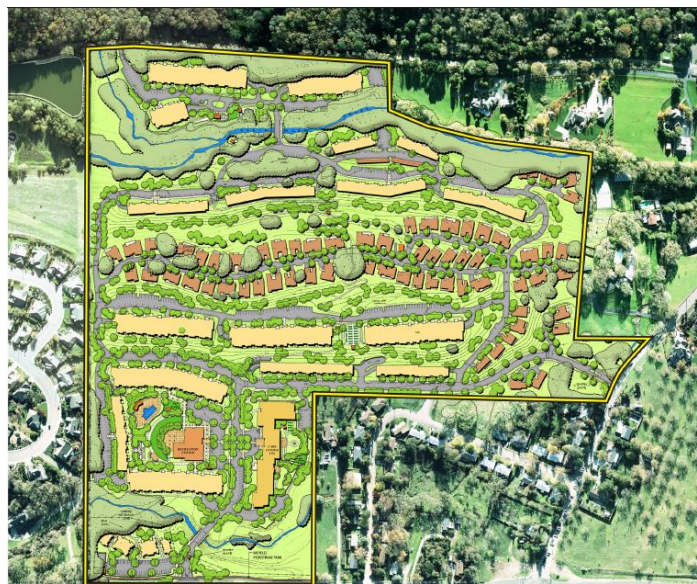
Figure 3: Illustrative site plan.

The project site is located on 17 lots including 6100 and 6160 Sonoma Highway, where - the project fronts State Highway 12 (known locally as the Sonoma Highway and referred to herein as the Sonoma Highway), and 300–425 Elnoka Lane in the southeastern portion of Santa Rosa in the urban/rural fringe. The approximately 68.73-acre site is located in the eastern portion of the City of Santa Rosa and is bounded by Sonoma Highway (northeast); Oakmont Village (southeast); Trione-Annadel State Park and Channel Drive (southwest); and Melita Road (northwest).