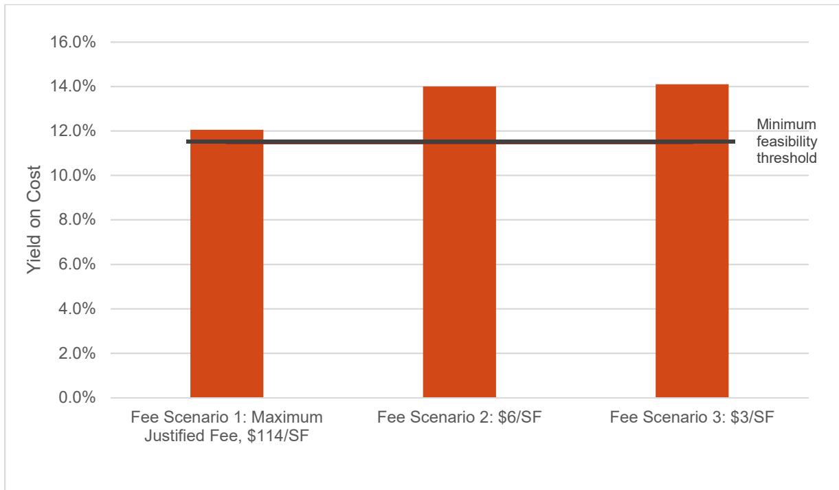
FIGURE 6: FEASIBILITY RESULTS, HOTEL PROTOTYPE