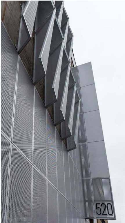
Museum on the Square

Santa Rosa issued building permits for 99,805 square feet of new non-residential construction last year. This includes the new Nordstrom Rack retail store at Coddington, the new senior care facility in Fountaingrove (Vineyard at Fountaingrove), the Museum on the Square renovation , and a new industrial building on Duke Court. Notable commercial projects that were completed include the renovation of the industrial building at College Avenue and Cleveland Avenue for Northbay Motorsports (55 College Avenue), construction of a three story, 87,800 square foot mini-storage facility (Storage Pro) on Sonoma Highway, renovation of Hansel Ford, and completion of the new Target and Dick's Sporting Goods at Coddington.