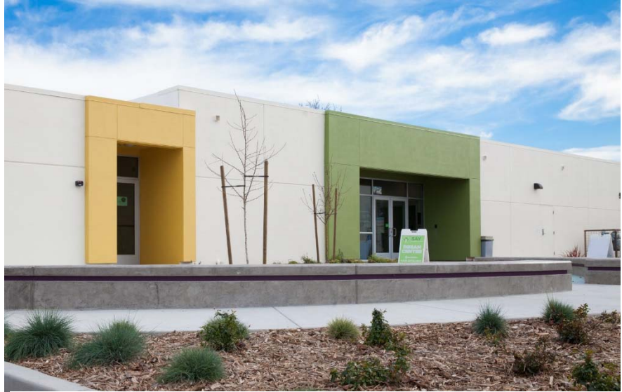
Social Advocates for Youth Dream Center