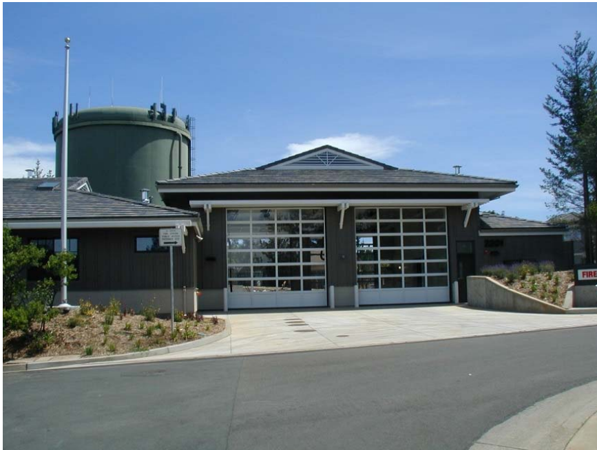
Fire Station 5

The General Plan calls for the addition of a new fire station in southeast Santa Rosa and for the relocation of the station on Burbank Avenue to a more easterly location to better serve the community. Due to the City's financial limitations, the development of a final new fire station near Kawana Springs and Petaluma Hill Roads called for in the plan has been delayed. The Fire Department is looking at sites in southwest Santa Rosa for relocation of the Burbank Avenue station and is considering a location closer to Highway 101 which might also serve the southeast area, but any relocation is some years away.