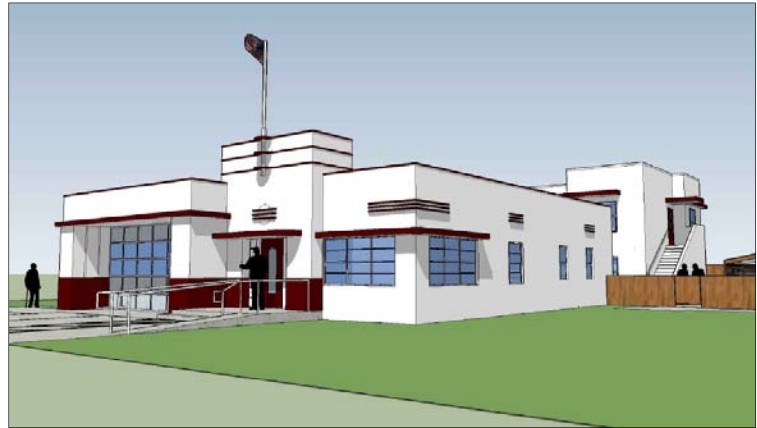
Rendering of Benton Veterans Village

The Housing Authority provided $171,141 to Community Housing Sonoma County for the development of Benton Veterans' Village , a 7 unit low income permanent, supportive housing facility. This project received funding previously. The project plans were approved by the Zoning Administrator in November 2015.