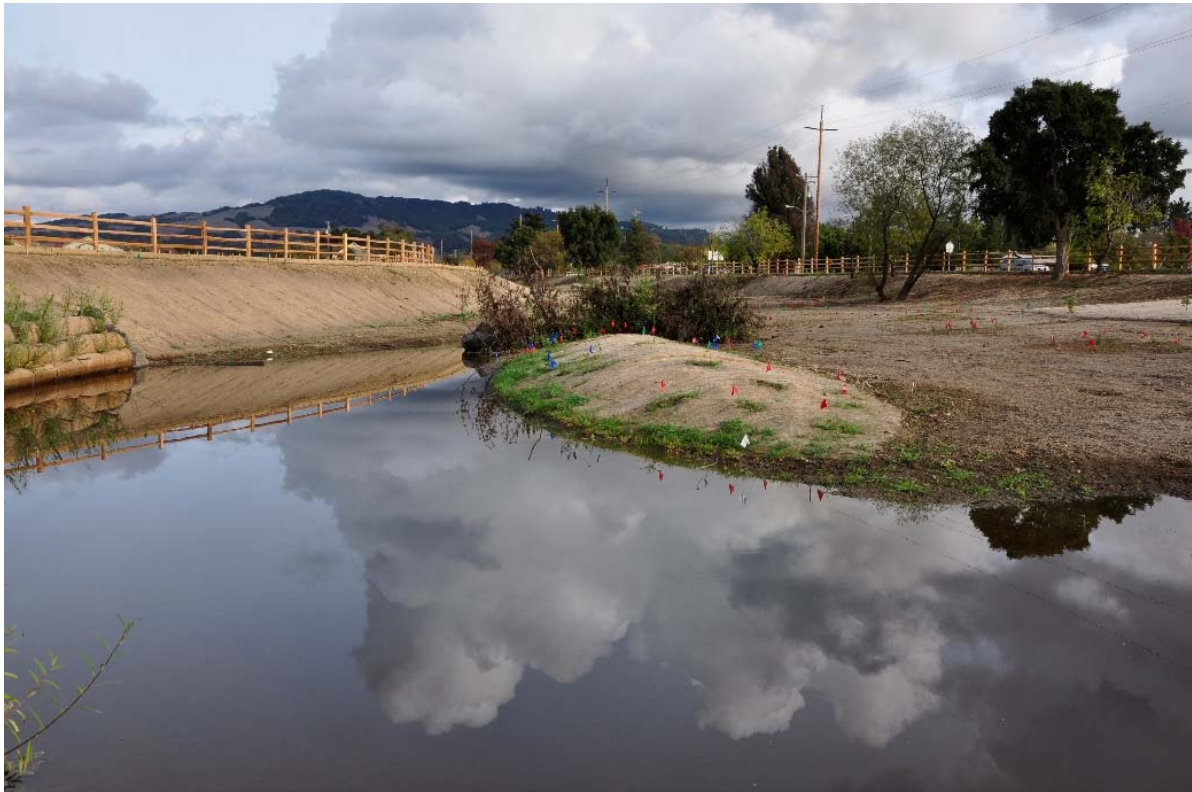
Restoration of Colgan Creek

Waterway conservation and stewardship continued last year as directed by the General Plan. The Creek Stewardship Program , supported through a partnership of the Sonoma County Water Agency and the City of Santa Rosa, helped care for more than 100 miles of creeks within the Urban Growth Boundary. Over 9,400 residents, 81% of whom were youths, participated in educational and stewardship related activities . Volunteers contributed 4,803 hours of community service for trail maintenance , care of restoration projects , and in removing trash and debris from creeks. Approximately 1,045 cubic yards of trash and debris