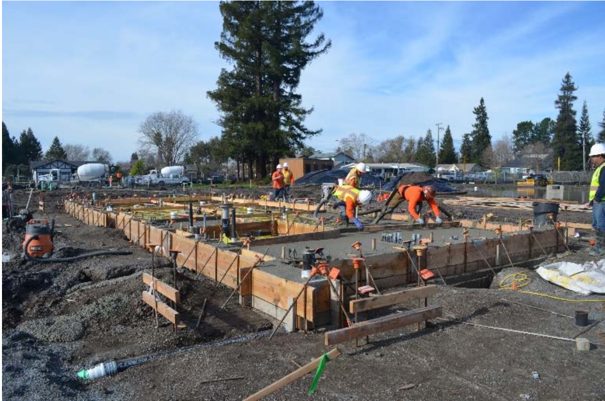
Bayer Park and Gardens under construction

Bayer Park & Gardens , a 6-acre neighborhood park that will include a community pavilion, skate park, half-court basketball court, playground, nature discovery area, picnic tables and barbeques, adult exercise equipment, parking and open lawn area on West Avenue in southwest Santa Rosa ( Roseland ) is under construction. The plan also includes an expansion of the existing community garden area, construction of a farm stand and preservation of the existing barn. The estimated completion date is fall 2016.