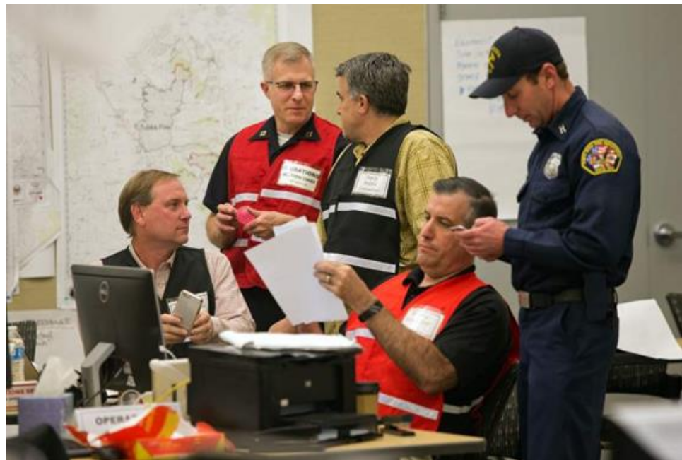
City of Santa Rosa EOC