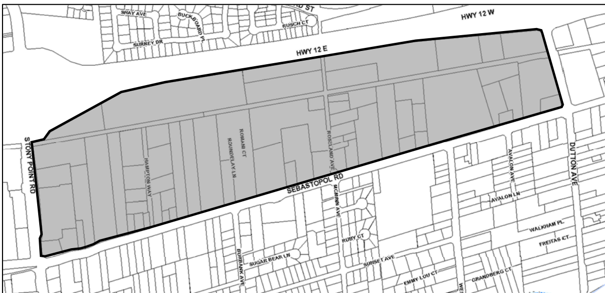
Figure 6-1 – Sebastopol Road north to Highway 12, between Stony Point Road and Dutton Avenue