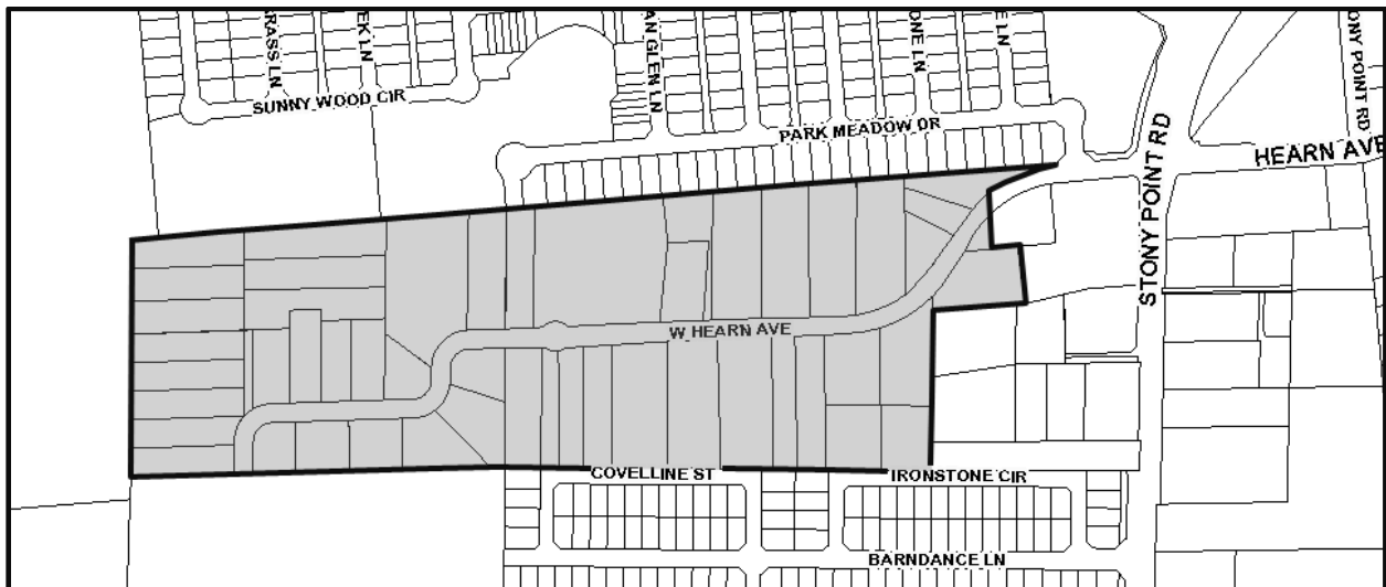
Figure 2-17 – West Hearn Avenue Neighborhood (shaded area with properties that primarily front, or receive access from, West Hearn Avenue)