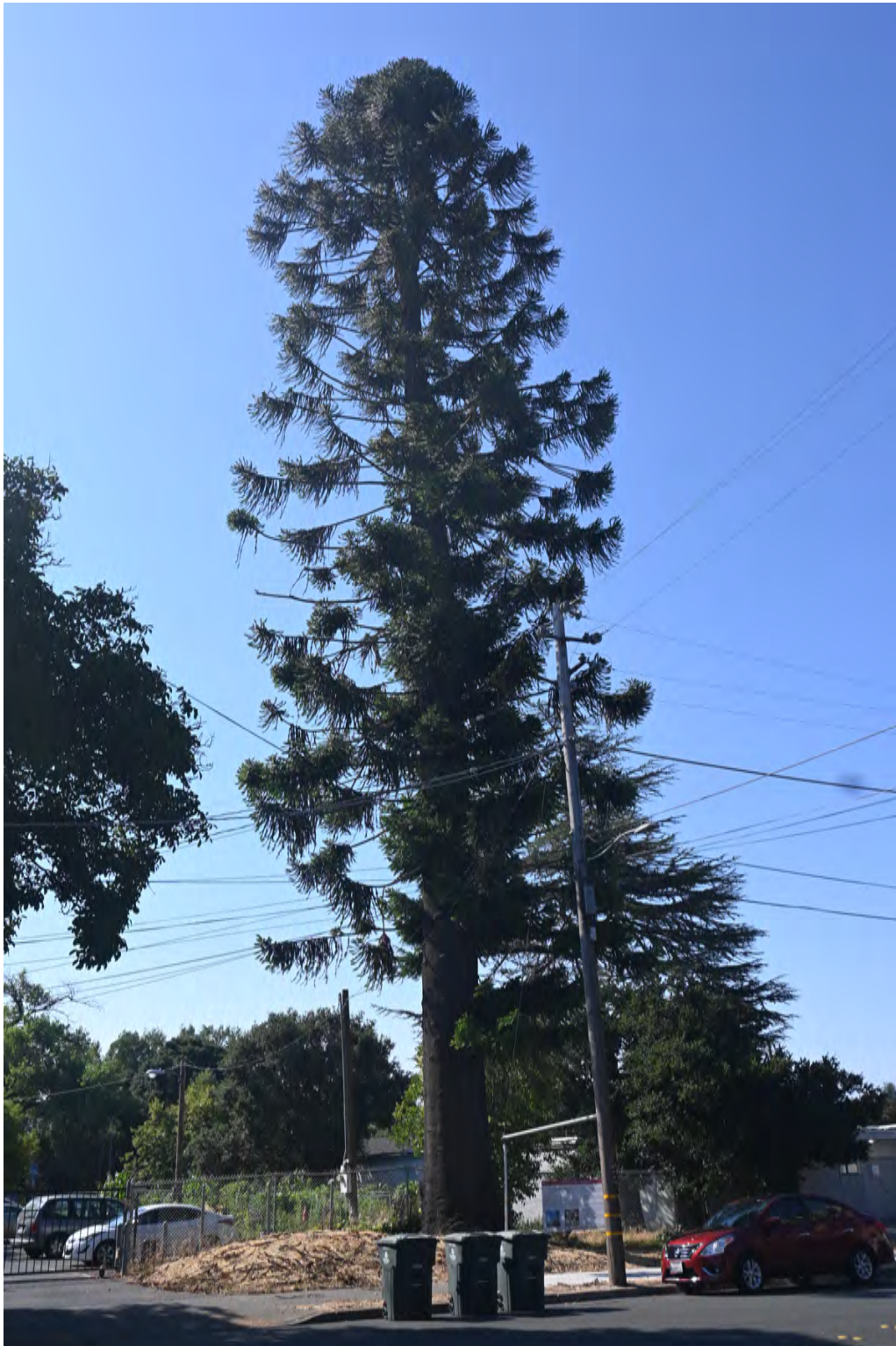
The view of the tree from the north and its location adjacent to the sidewalk, resident garden, street parking, and garden driveway.