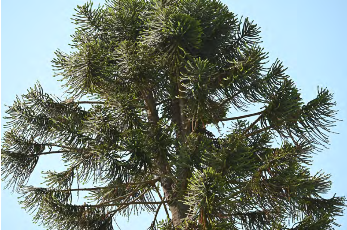
The view of the three secondary trunks formed in the upper crown. This multiple-trunk structure is considered a potential defect.