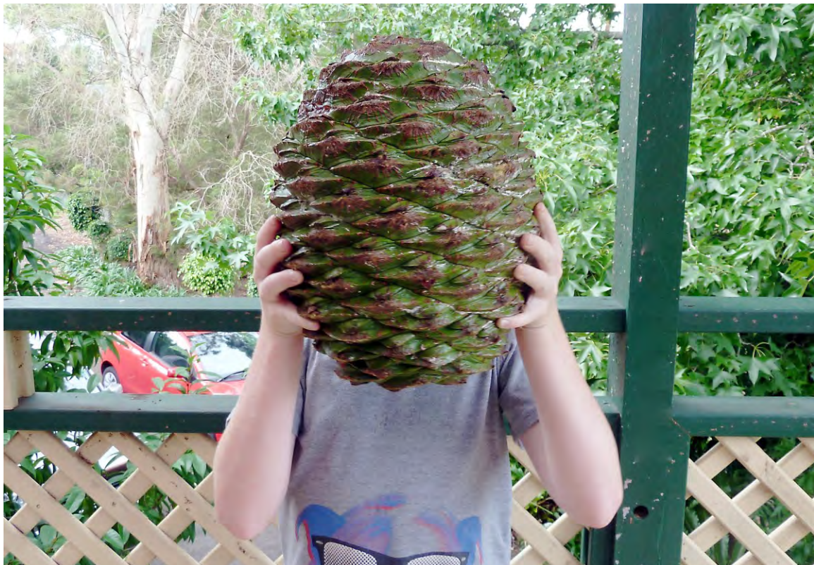
Web image showing the size of the female cone.