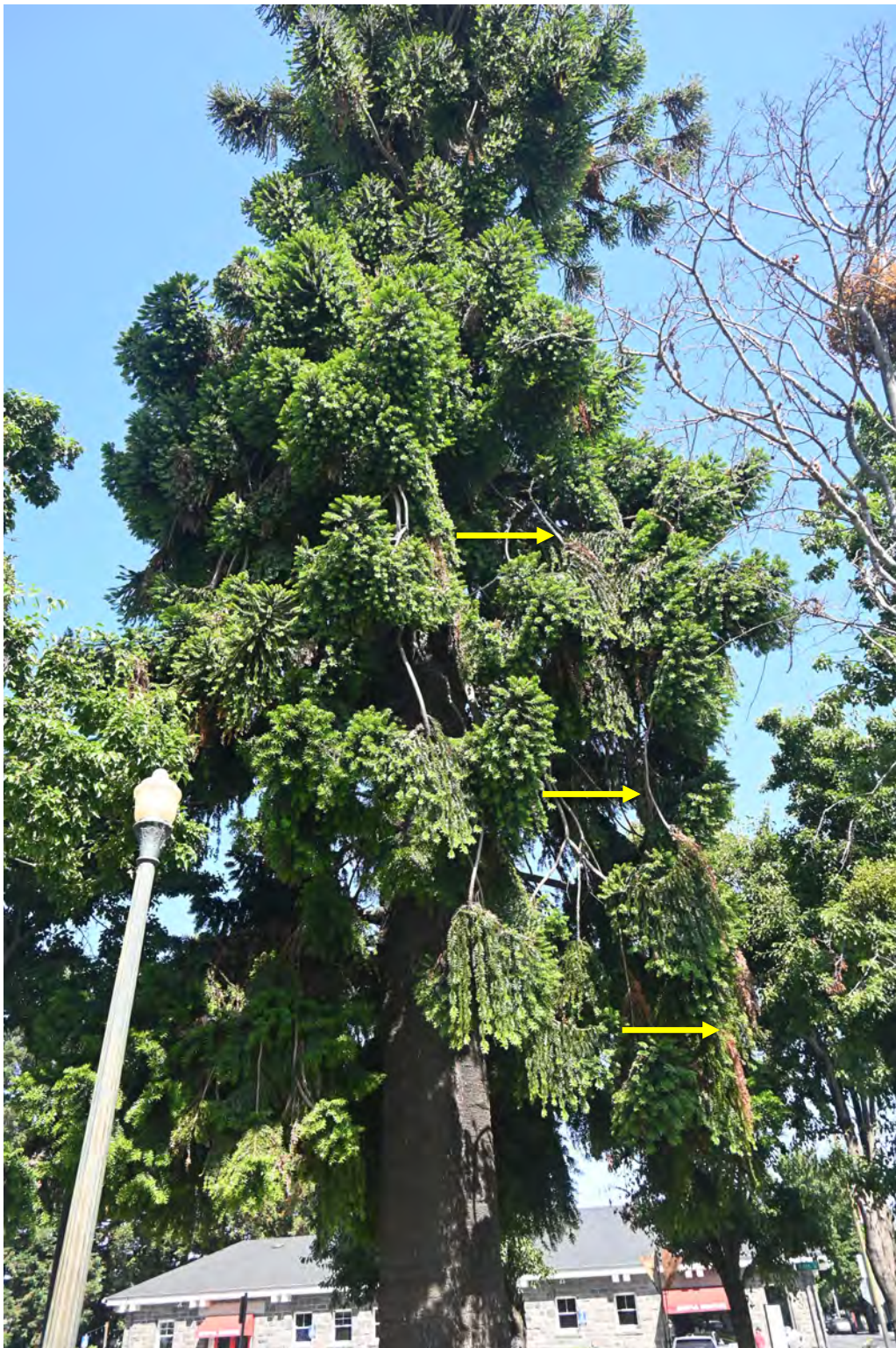
The Bunya pine in Railroad Square with arrows indicating broken branches. The parking lot, sidewalk, and park bench are located beyond the crown edge, reducing the risk of impact from branches and cones.