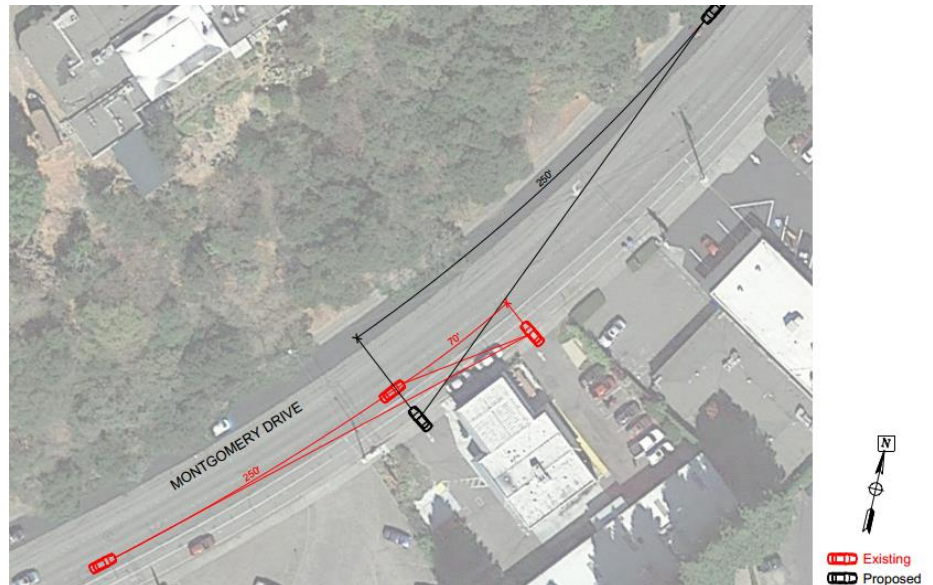
Figure 1. Existing and Proposed Line-of-sight

To improve the line-of-sight for motorists exiting the driveway, the applicant proposes reversing to clockwise the direction of the on-site one-way circulation. By reversing the direction, the line-of-sight for motorists increases from 70 feet to 250 feet without the loss of any street parking spaces, as shown in Figure 1.