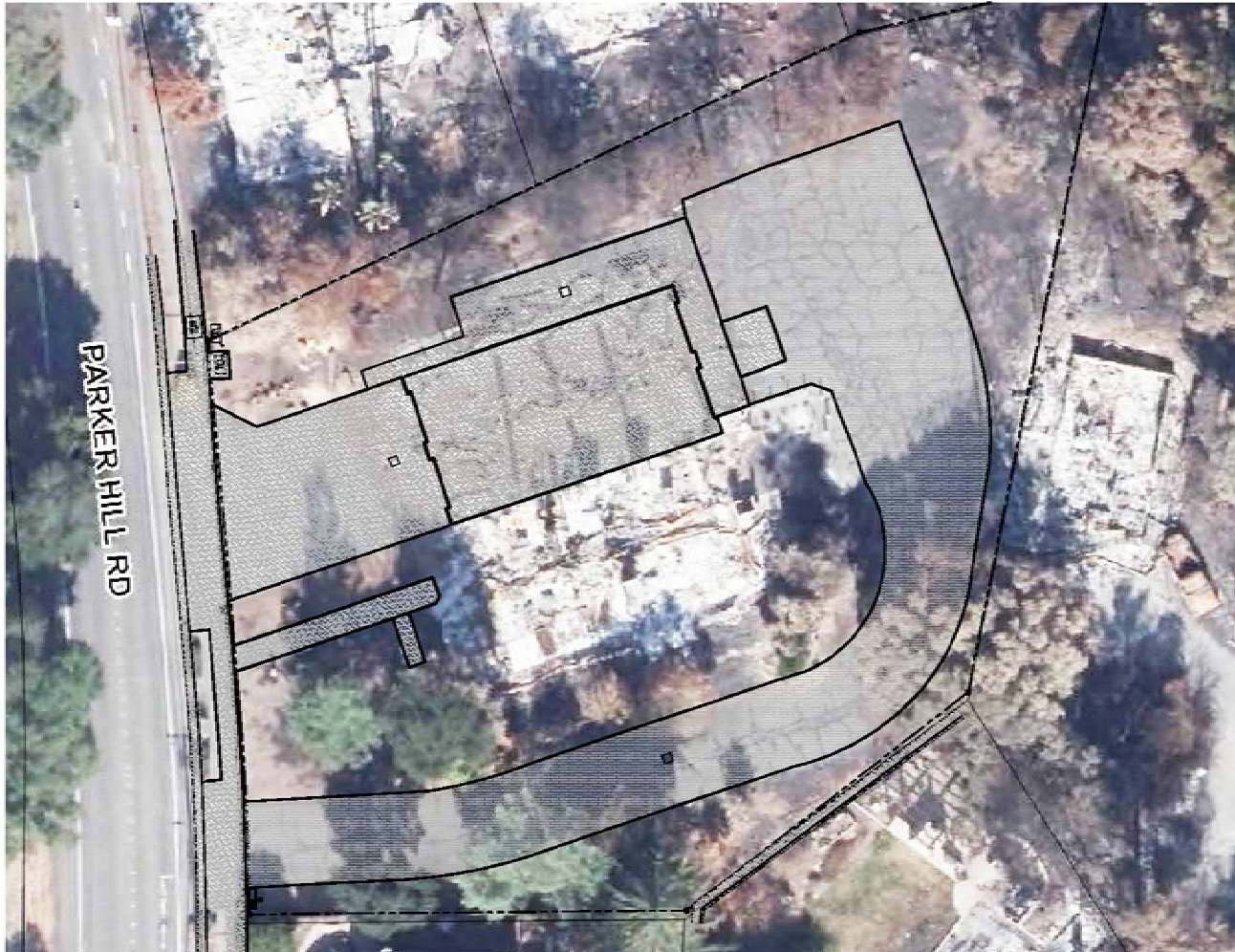
3480 Parker Hill Road – post fire