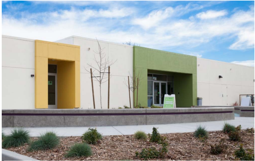
Social Advocates for Youth Dream Center