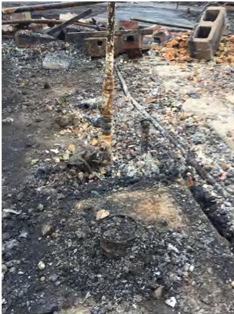
Typical Lot with sewer inlet full of debris

As a result of the fire damage to the utilities and the park infrastructure, and, the fact that the park operator has estimated it would take approximately two years for the park infrastructure to be repaired enough to lawfully permit a unit to be installed or occupied within the park, the 44 remaining homes that did not sustain fire damage, the Department deems as substandard. Therefore, the prohibited occupancy shall remain in effect until the park infrastructure is rebuilt, replaced or corrected.