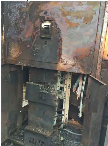
Main electrical distribution panel.