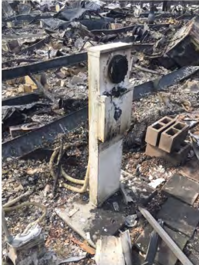
Typical example of destroyed electrical pedestal.