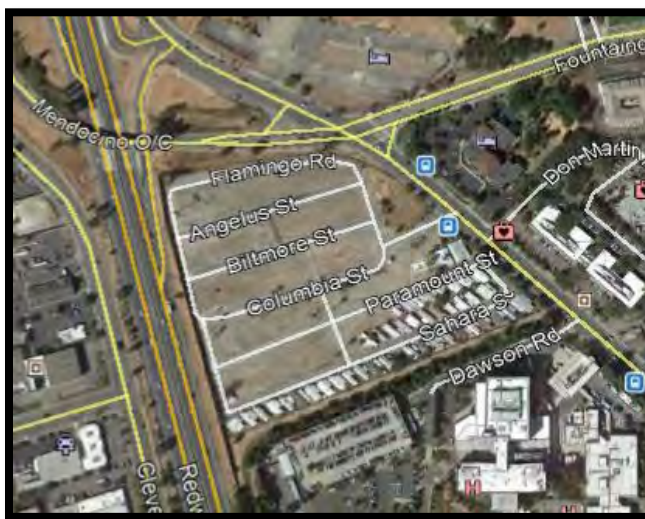
Figure 2: Journey's End Mobile Home Park, post-2017 Tubbs wildfire

In the early morning of October 9, 2017, the Tubbs wildfire destroyed the Park's infrastructure and 117 of the mobile homes. The 44 mobile homes that remained standing following the wildfire have been uninhabitable since the wildfire due to damaged utilities. In the months following the wildfire, HCD issued a report documenting the extent of the destruction to the Park and its infrastructure. In that report, HCD prohibited occupancy of the Park "until the Park infrastructure is rebuilt, replaced or corrected" (See HCD Report at Attachment F). Subsequent to the HCD report, the State Water Resources Control Board determined that the on-site well that historically provided water to the mobile homes can no longer be used for domestic purposes and it was determined current plumbing codes will not allow the use of an above-ground water distribution system like the one that existed in the Park prior to the wildfire. As a result, no residents have resided in the Park in the more than two years since the wildfire occurred (As required by Santa Rosa Municipal Code Section 20-28.100.J.3.c.2; See Figure 2). Given the significant cost to construct a new water system connected to City water service, as well as restore the Park's sewer, gas, and electric systems, the Park Owner has concluded that it is not economically feasible to reopen the Park and it is, therefore, necessary to undertake the formal Park closure process required by the Government Code and Santa Rosa Municipal Code.