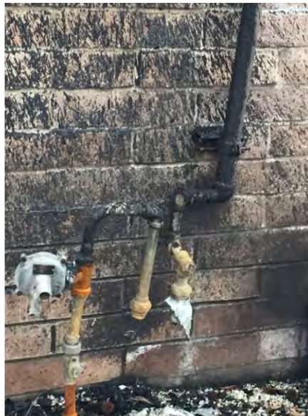
Gas meter connection