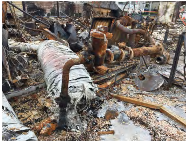
Main gas service inlet and electrical transformer