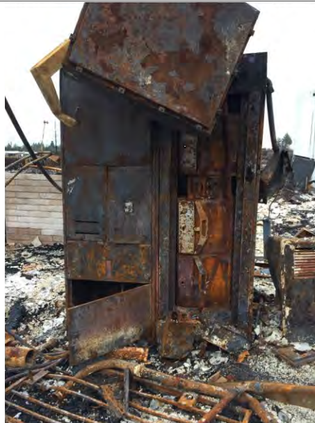
Electrical distribution panel.