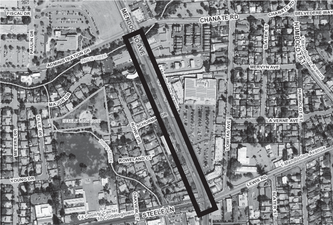
Mendocino Avenue from Steele Lane to Administration Drive