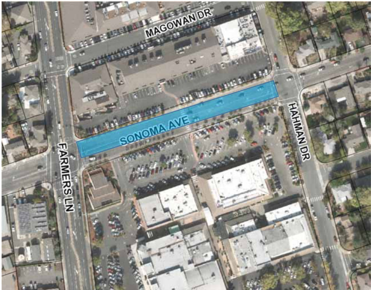
Blue highlighted area indicates project location. (Maintains existing Class II bike lanes)