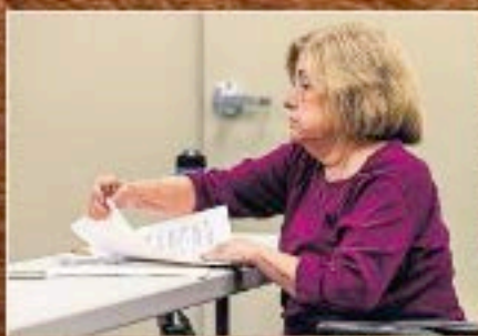
Links (top), already and comments of record (middle) and (bottom) board meetings, she argued against the board's policy on removing candidate filing fees at the monthly meeting Sept. 12.