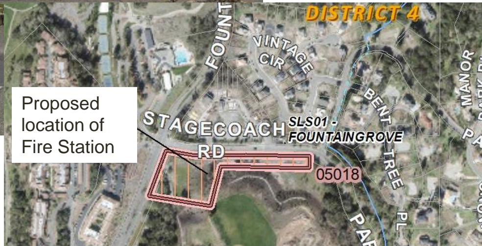
Proposed location of Fire Station