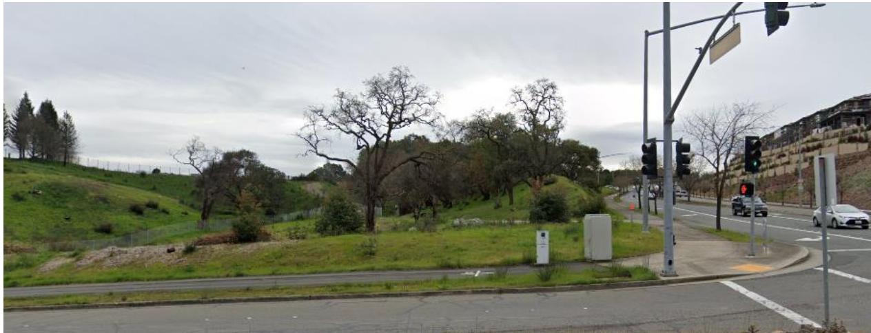
View from Stagecoach Road looking south

After a lengthy search, Council gave direction to staff in closed session to negotiate the purchase of ~ 2.11-acre portion of Keysight's campus located at the corner of Fountaingrove Parkway and Stagecoach