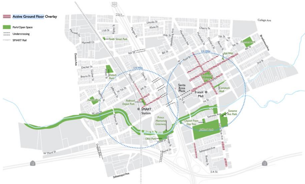
Figure 3-18 – Active Ground Floor Overlay