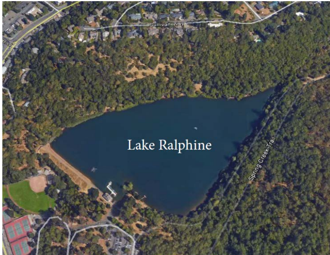
Howarth Park / Lake Ralphine