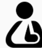
Assaults on Officers Data