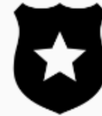
Officer Involved Shooting Data