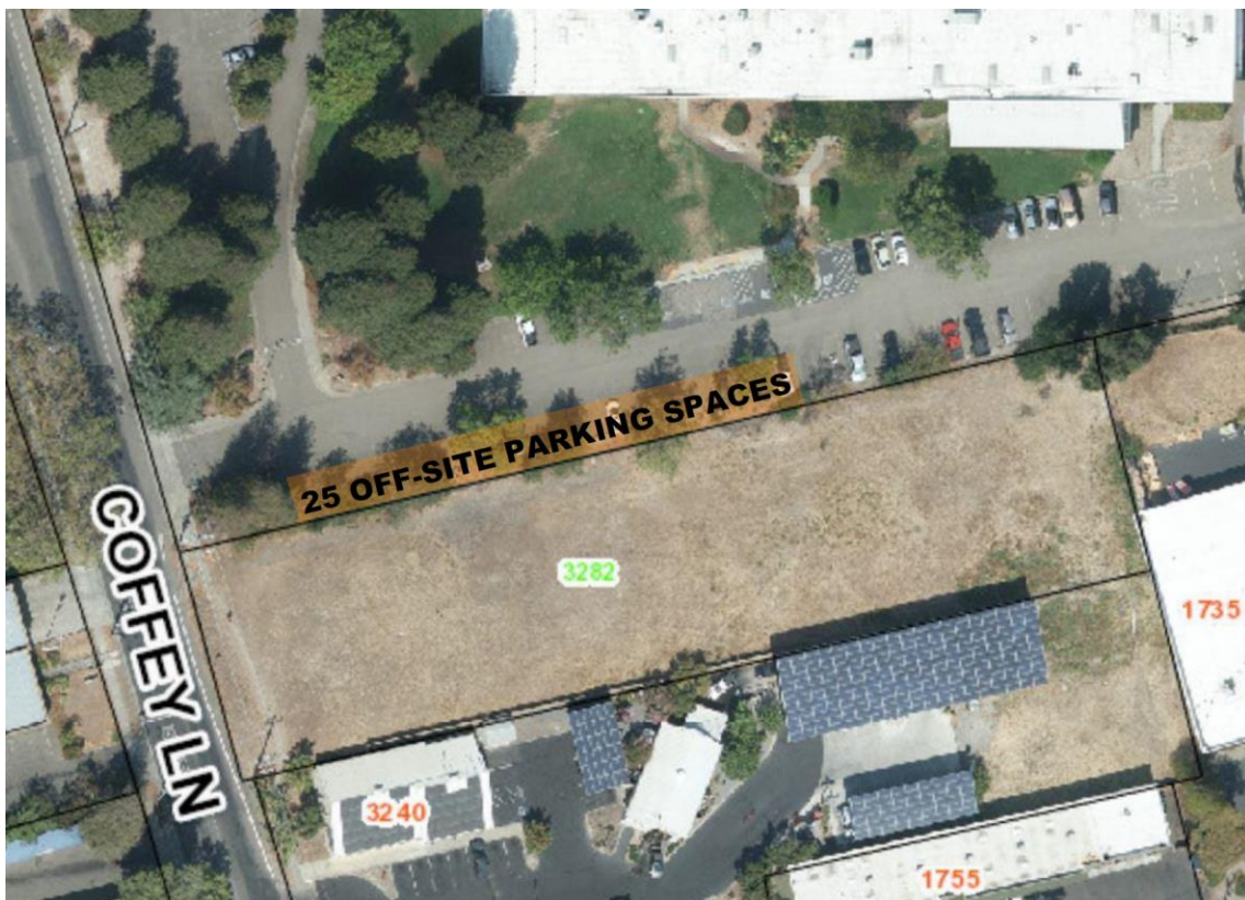
Figure 1: Aerial Image

A Design Review application has been submitted for the development of the self-storage project, which will be considered by the Design Review Board (DRB) following the action of the Planning Commission for the Conditional Use Permit (currently the project is scheduled to be consider by the DRB on October 5, 2023).