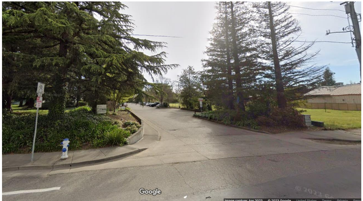
Figure 2: Street View Image – Looking East from Coffey Lane.