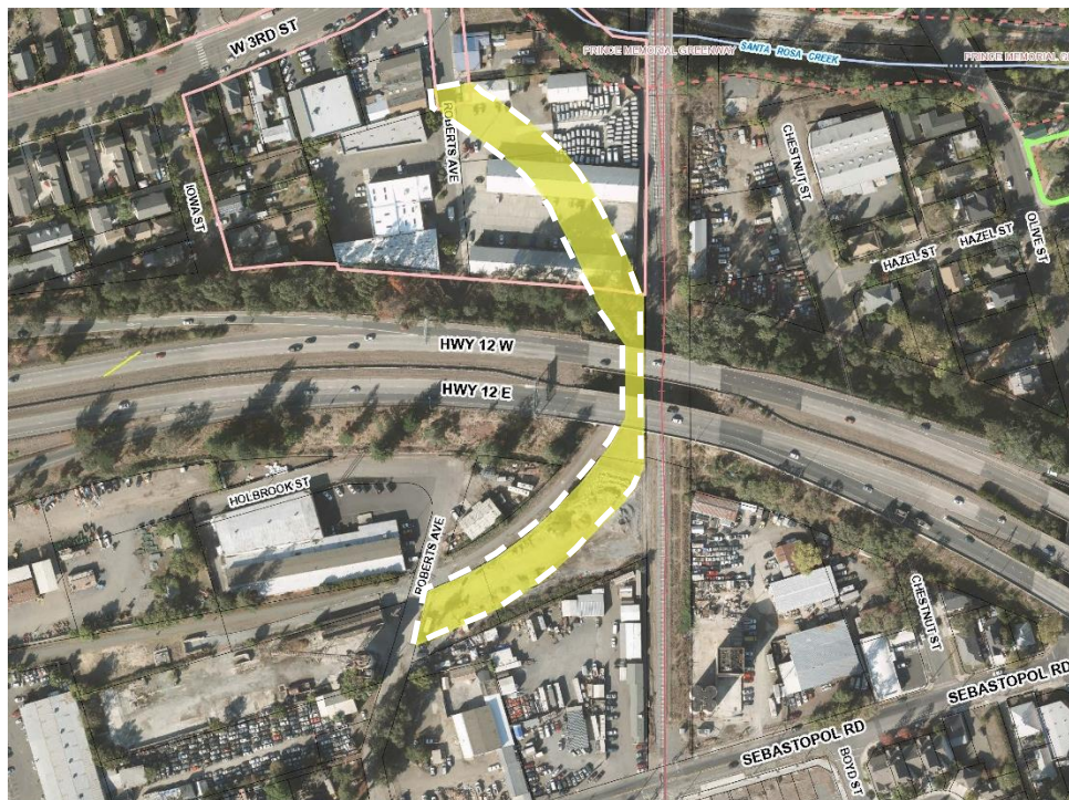
Current Alignment of Roberts Avenue as identified in the Downtown Station Area Specific Plan

The Roberts Avenue connection was identified in the 2007 Downtown Station Area Specific Plan as an important circulation element, connecting the northeast corner of Roseland, which is envisioned for high density transit oriented development, to the future downtown Sonoma Marin Area Rail Transit (SMART) station. During the development of the Downtown Station Area Specific Plan, it was determined that a potential location for the connection of Roberts Avenue was under an existing Highway 12 overpass, where the SMART rail line and the Joe Rodota Trail are currently located (see image below, prepared by staff).