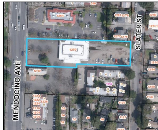
Figure 1: 1250 Mendocino currently developed as a commercial site, with frontage on Mendocino Ave & Slater St

The application for the Ronchelli Rezoning proposes to rezone a property located at 1250 Mendocino Avenue, from its current dual zoning of CG (General Commercial) and R-3-15 zoning districts to the CG (General Commercial) zoning district. The CG (General Commercial) zoning district is consistent with the parcel's General Plan designation of Retail & Business Services. The subject site is currently developed with a commercial building and surface lot, facing Mendocino Ave. The property has frontage along Mendocino Avenue and Slater Street. While there is no additional development proposed as part of this project, the rezoning will allow for the orderly development and maintenance of the property.