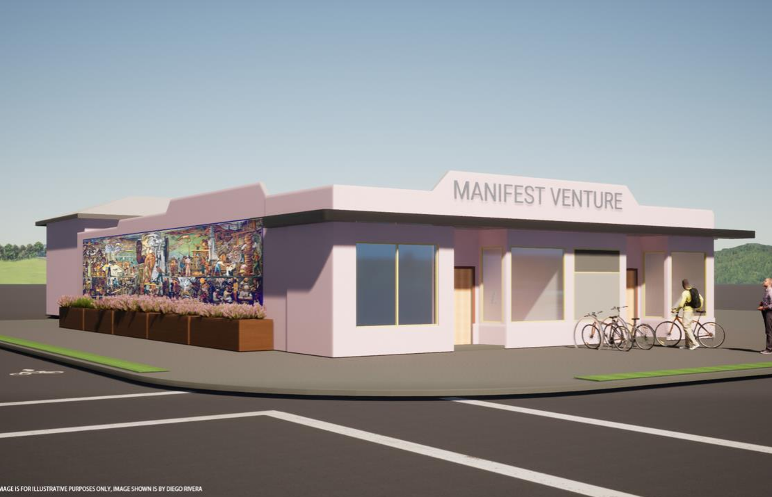
IMAGE IS FOR ILLUSTRATIVE PURPOSES ONLY, IMAGE SHOWN IS BY DIEGO RIVERA