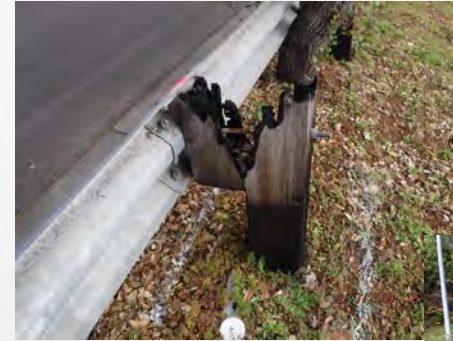
101 Metal beam burned guardrail posts replaced