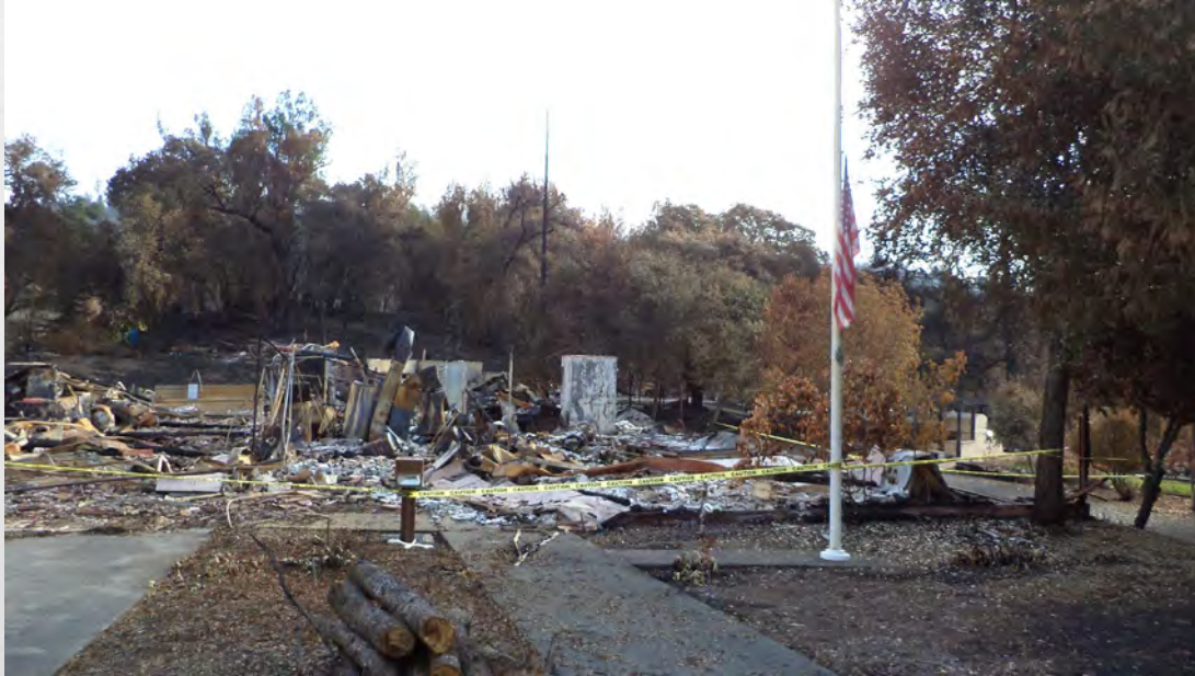
The former Fire Station 5 on Parker Hill Road was selected as the site