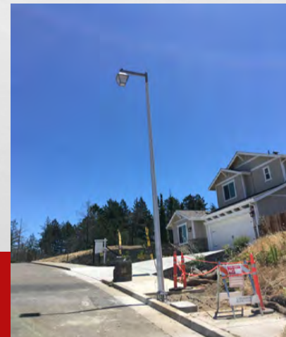
41 Streetlights restored in Fountaingrove